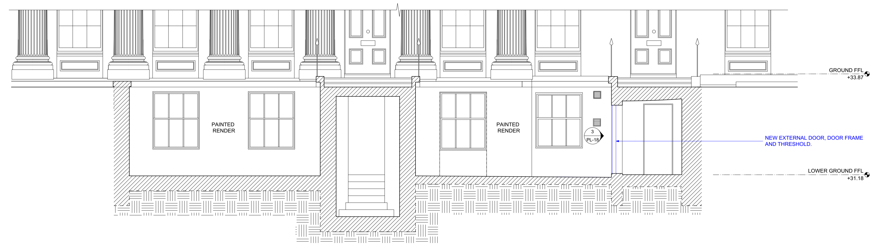
2 PROPOSED FRONT LIGHT WELLS SECTION SCALE 1:50