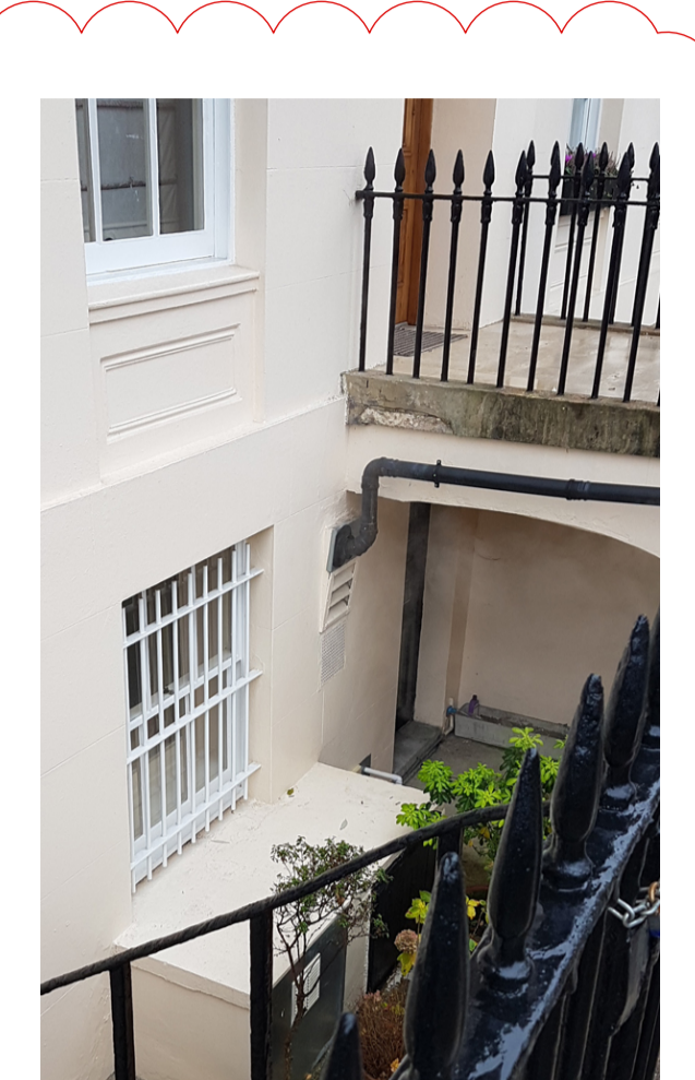
LOUVRES IN NO. 33 CHESTER TERRACE FRONT LIGHT WELL