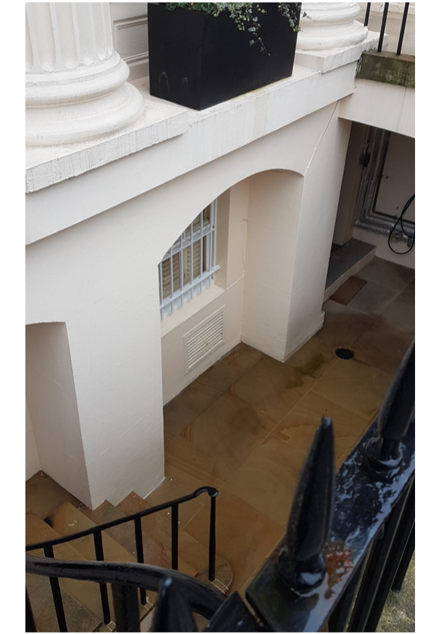
LOUVRES IN NO. 30 CHESTER TERRACE FRONT LIGHT WELL