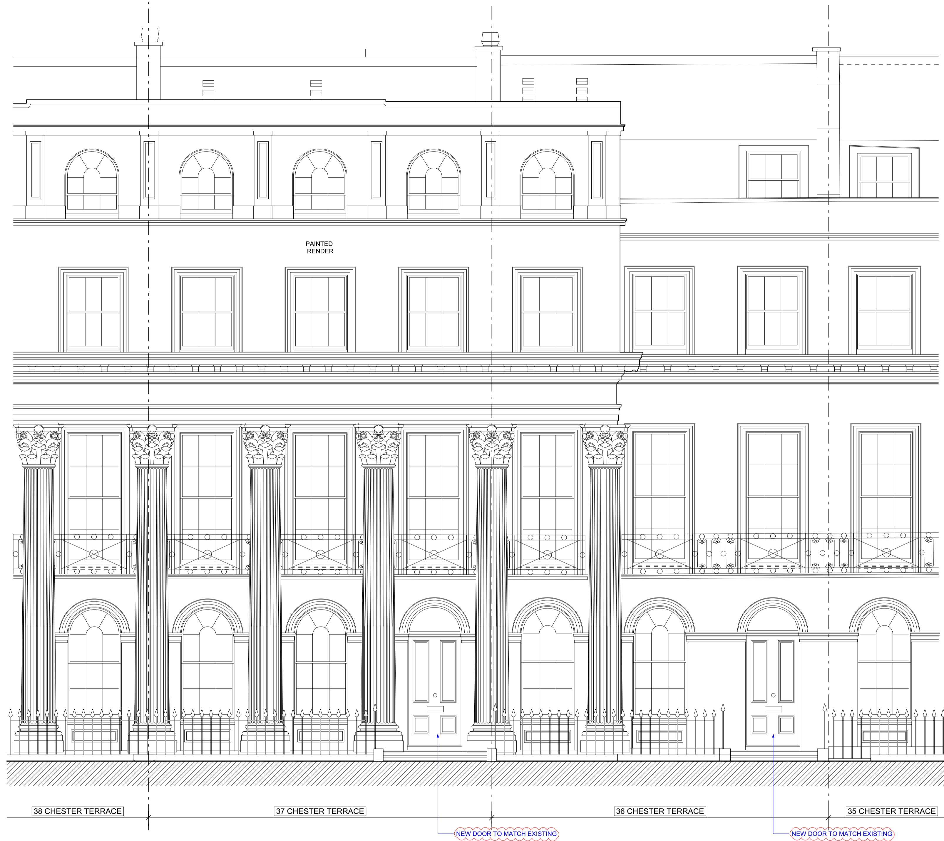
1 PROPOSED FRONT ELEVATION SCALE 1:50