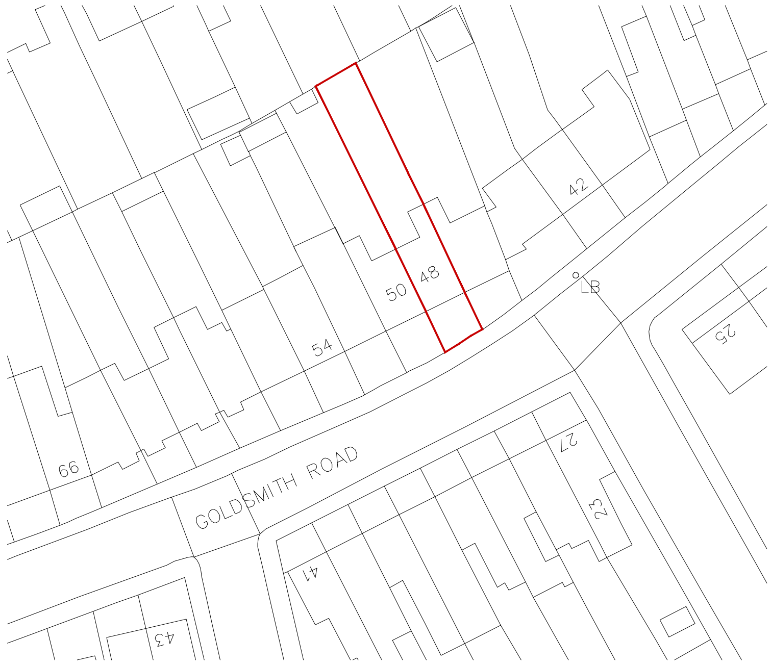
Block plan 1:500