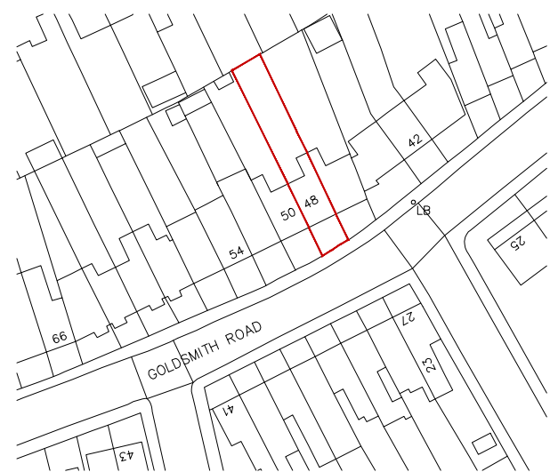
Location plan 1:1250