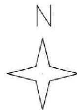
LOCATION PLAN SCALE 1:1250@A3