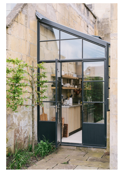
Precedent Image for window / door type.