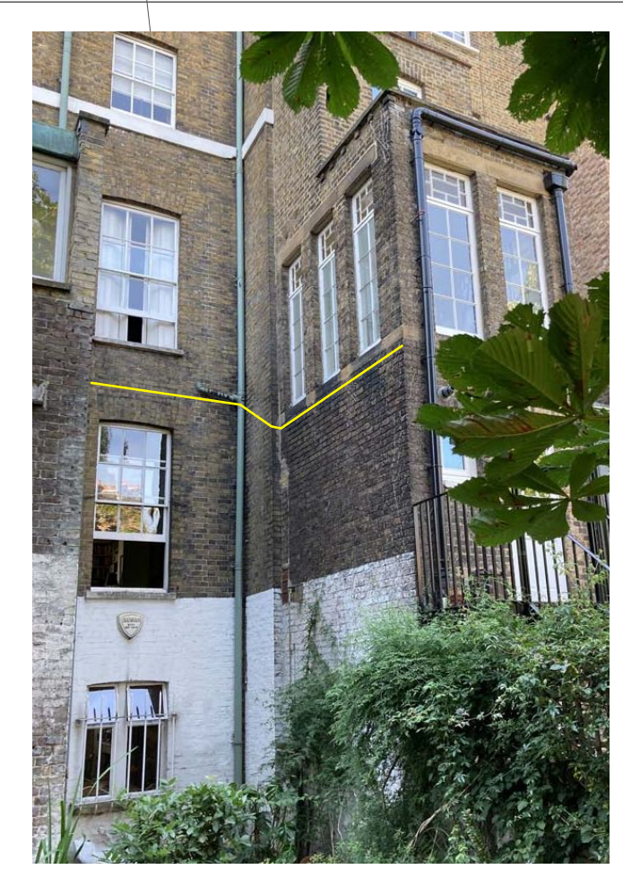
Proposed roof line highlighted in yellow. The angle fixed glazed roof light that connects the roof back to the house allows for a minimal visual harm to the existing ground floor rear window.