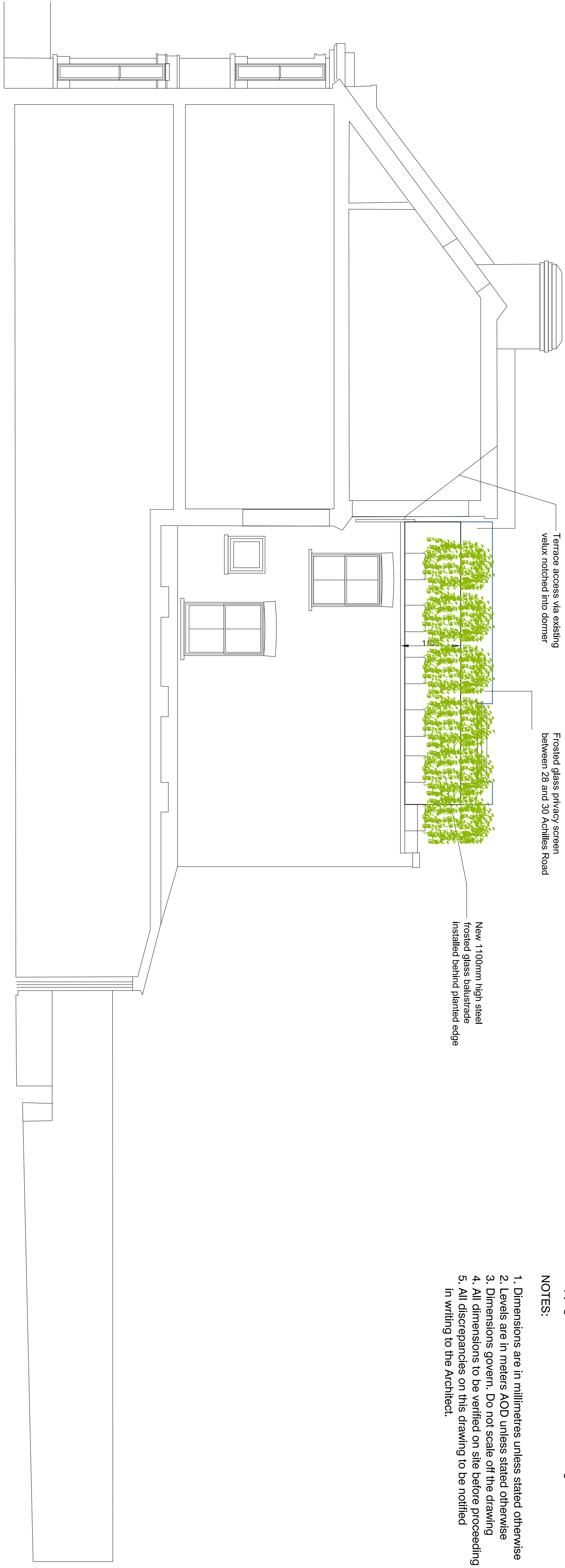
Proposed Cross Section/Side Elevation (South West) 1:50@A1/1:100@A3