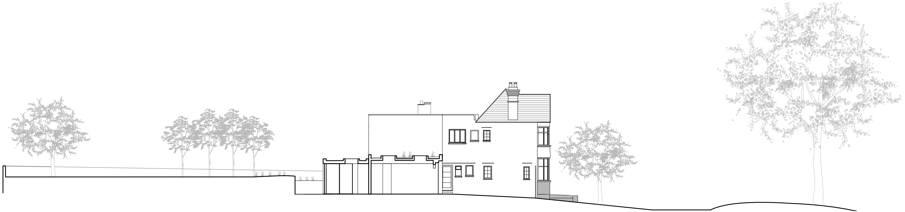
Side Elevation B- 1:200