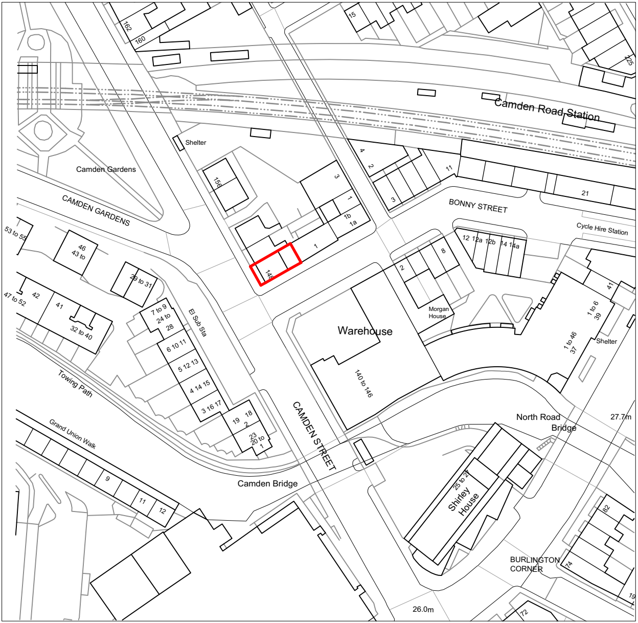
1 Site Plan E= 1:1250