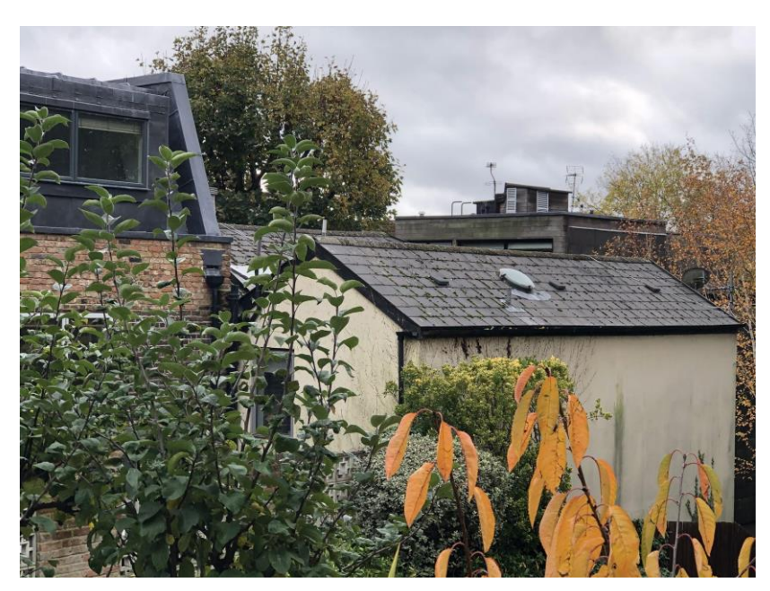
Existing roof tiles of house no.1 - Example 1