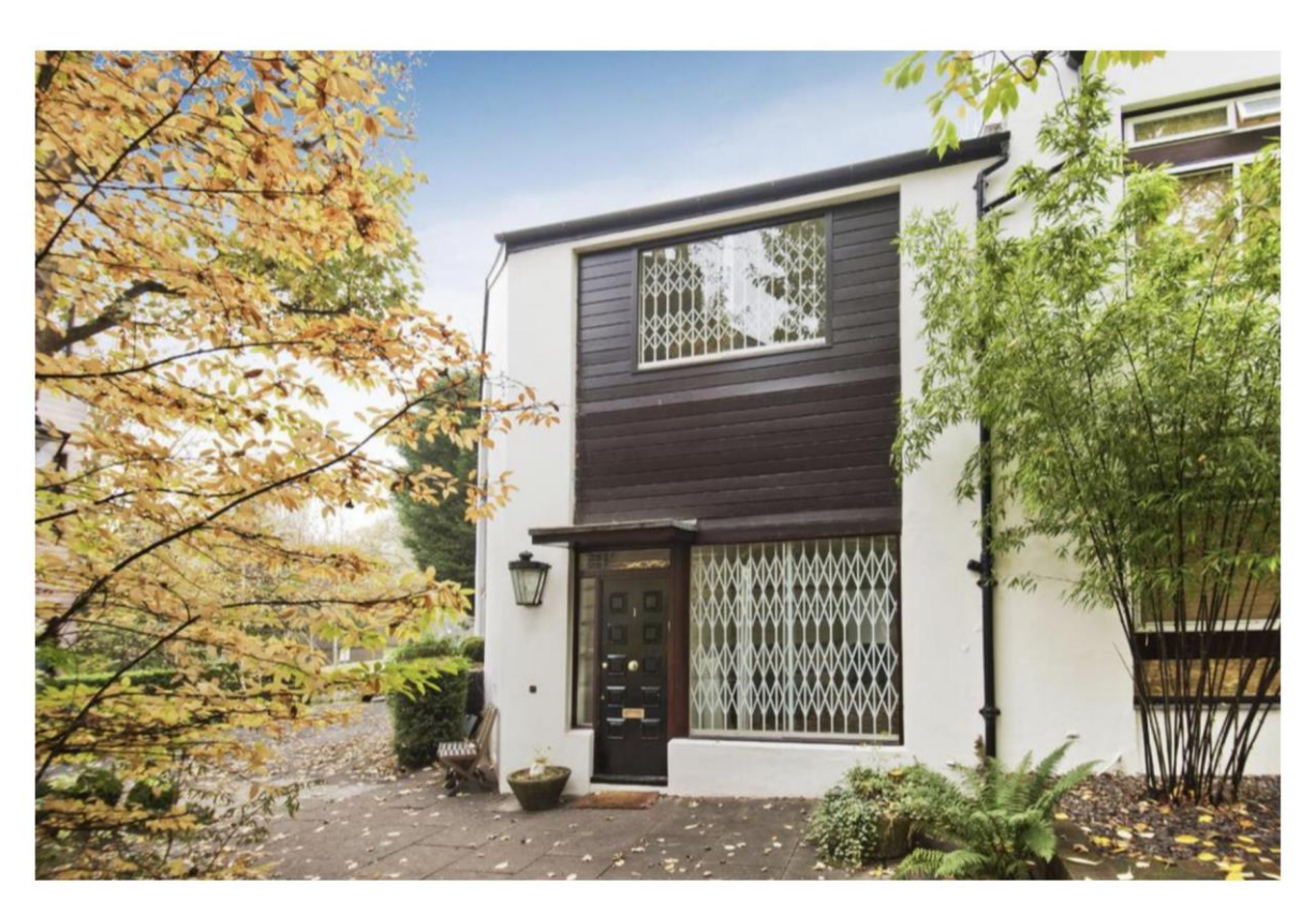
Elevated side view of 1 and 2 Oak Hill Park Mews