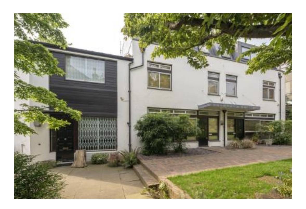
Front view of 1, 2 and 3 Oak Hill Park Mews