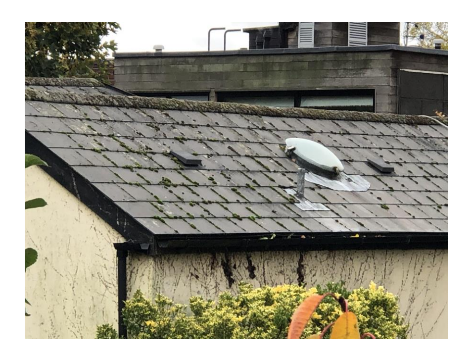
Existing roof tiles for house no.1 - Example 2.