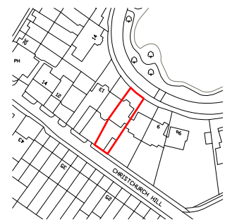
1 site location plan 1:1250