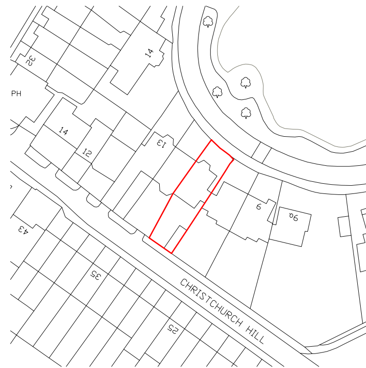
2 site location plan 1:500