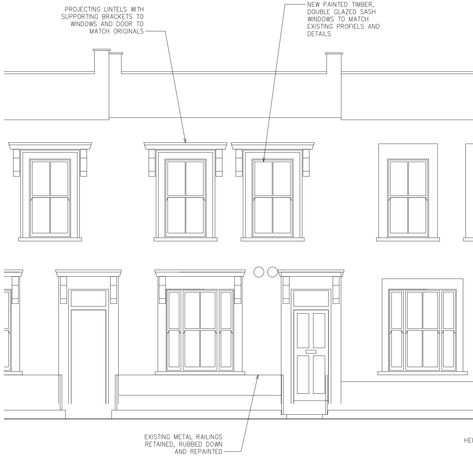
1 PROPOSED FRONT ELEVATION 1 : 50

THIS DRAWING AND ANY DESIGNS INDICATED THEREON ARE THE COPYRIGHT OF THE ARCHITECT. ALL RIGHTS ARE RESERVED. NO PART OF THIS WORK MAY BE REPRODUCED WITHOUT PRIOR PERMISSION IN WRITING FROM THE ARCHITECT.