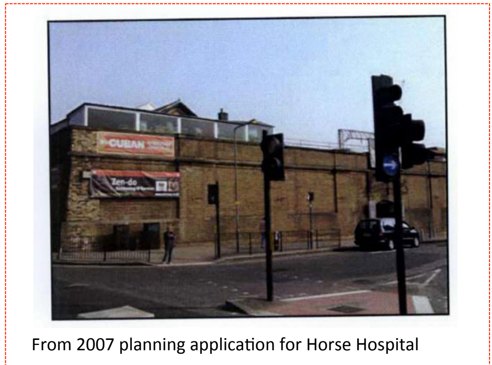
From 2007 planning application for Horse Hospital