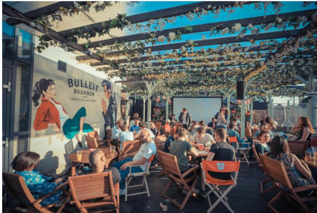
The FEST terrace.

Underneath this lush pergola, you'll find live acoustic music by day, and DJs by night. The bar serves up delicious cocktails (Pimm's and Aperol Spritzes among them) and craft ales, while wood-fired pizzas are available from the outdoor pizza oven. A big screen shows major sporting events or serves as an outdoor cinema – see what's on here . (Offer: get a pizza and a pint for £10 or two pints for £8.50 .)