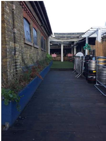
Current photos of existing