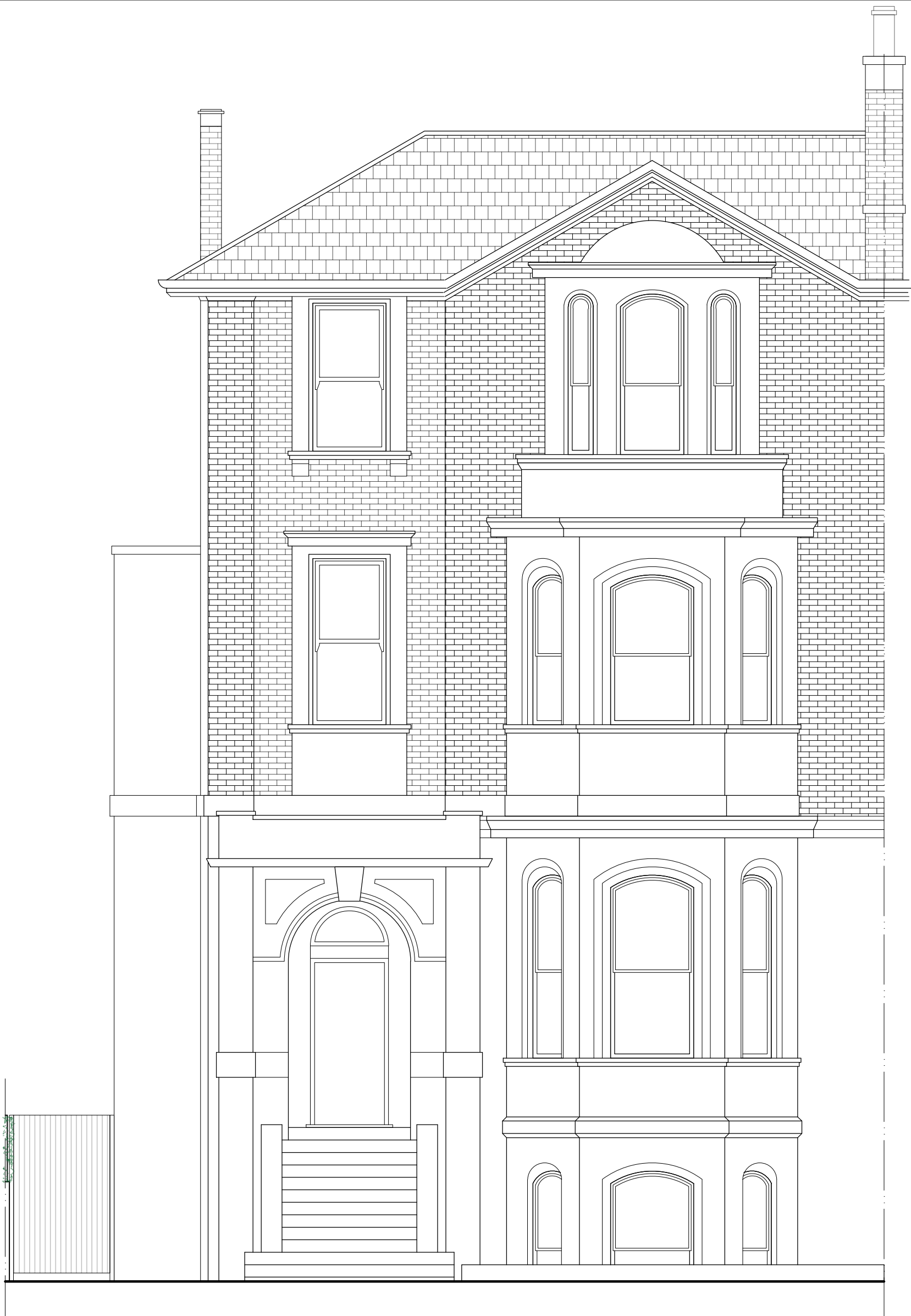
Existing Front Elevation Scale 1:50