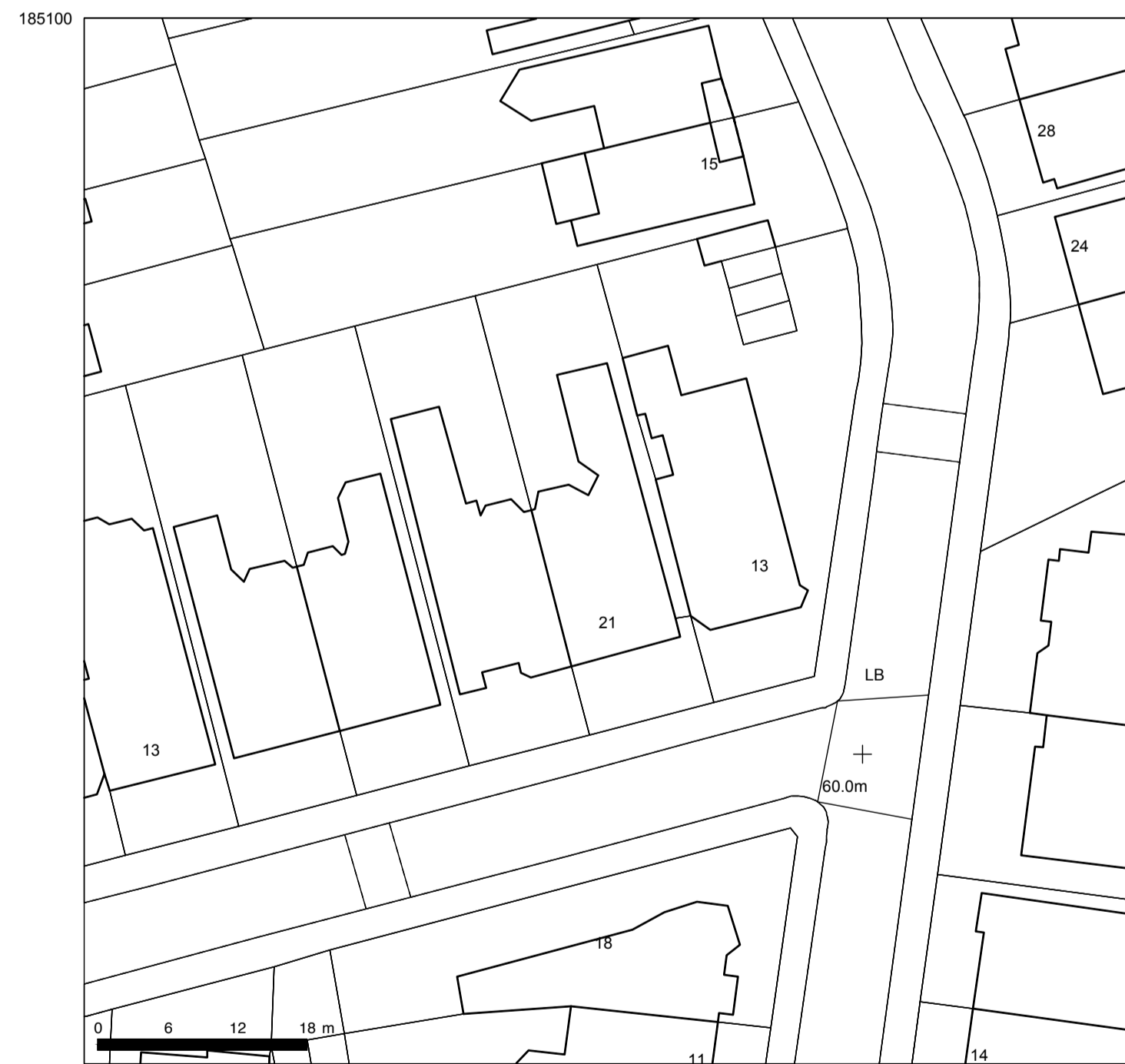
EXISTING SITE/BLOCK PLAN 1:500