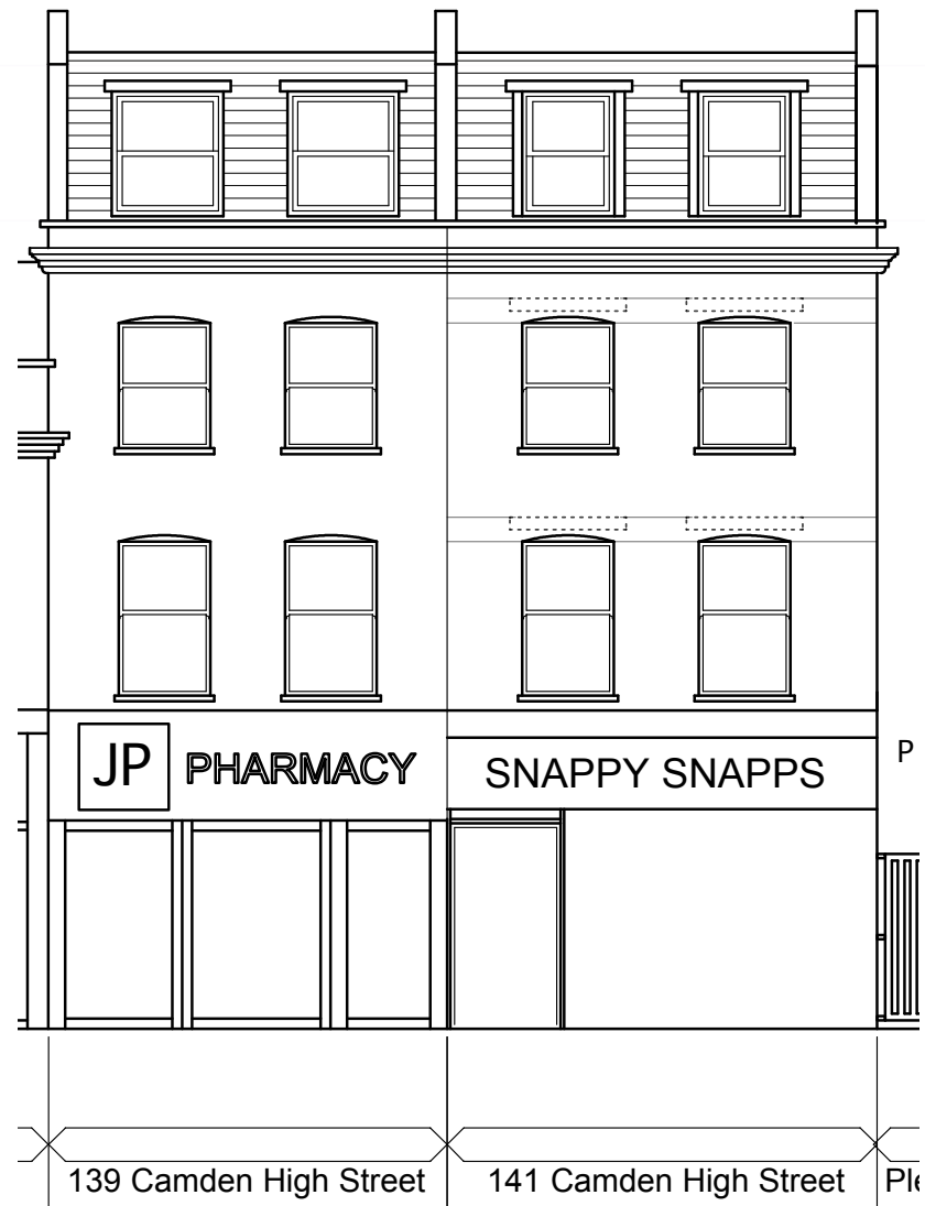
B Front Elevation (East)