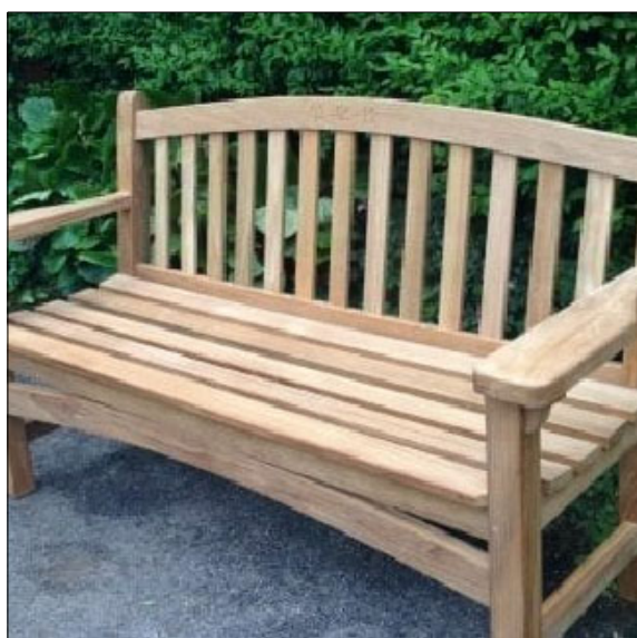
Proposed Garden Bench. See dwg. 1052-11-01 for location Supplier : Solid Oak Hardwood Furniture 1800mm Width.