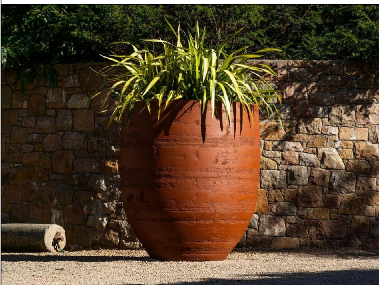
Proposed Feature Pot. See dwg. 1052-11-01 for location Supplier : Torc Pots. 100cm Top, 90cm High, 45cm Base.