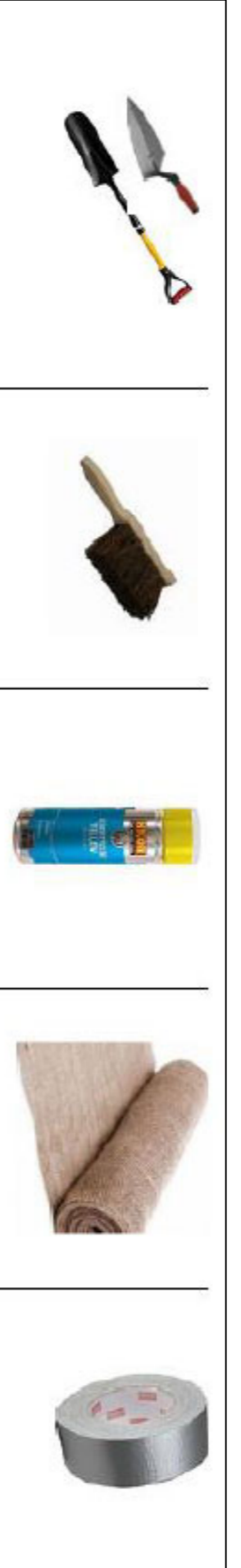
Tools for the works