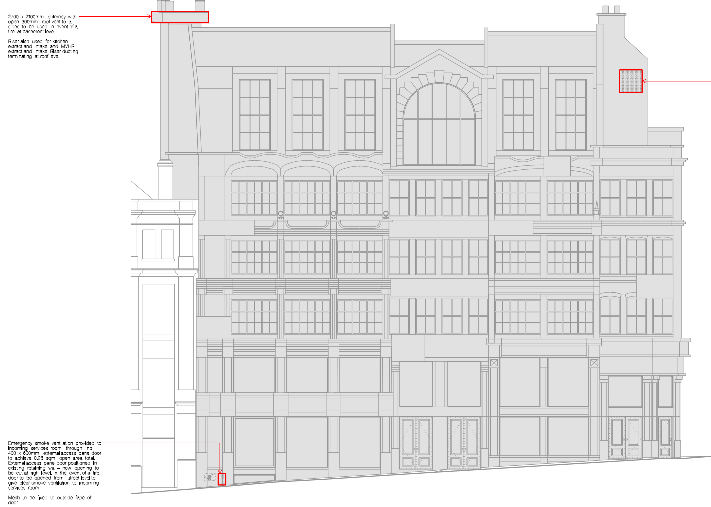
① NORTH ELEVATION VENTILATION LOUVRE LOCATION