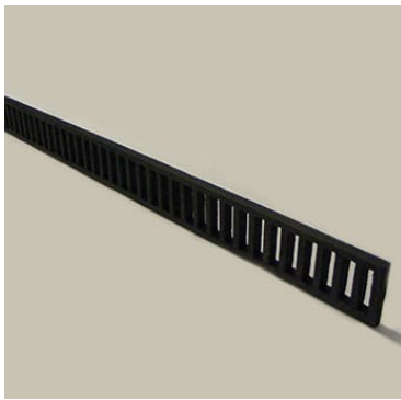
DOORSTEP GRILLES Long Slotted 3" Gratings £160.00 – £250.00