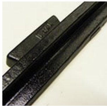
DOORSTEP GRILLES Cast Iron Bearer £45.00