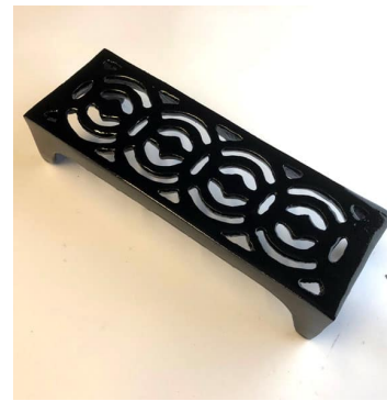
9 X 3" (225 X 75MM) Reg3 Air Brick £70.00