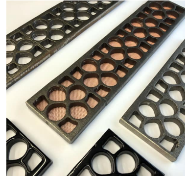
VENT AND DRAINAGE GRILLES Custom Length 3" Daisy Grilles £60.00 – £230.00