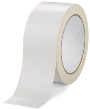
CONSERVATION VENT GRILLES Duct Tape White – High Strength £15.00