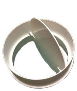
CONSERVATION VENT GRILLES White Plastic Flap Valve £15.00