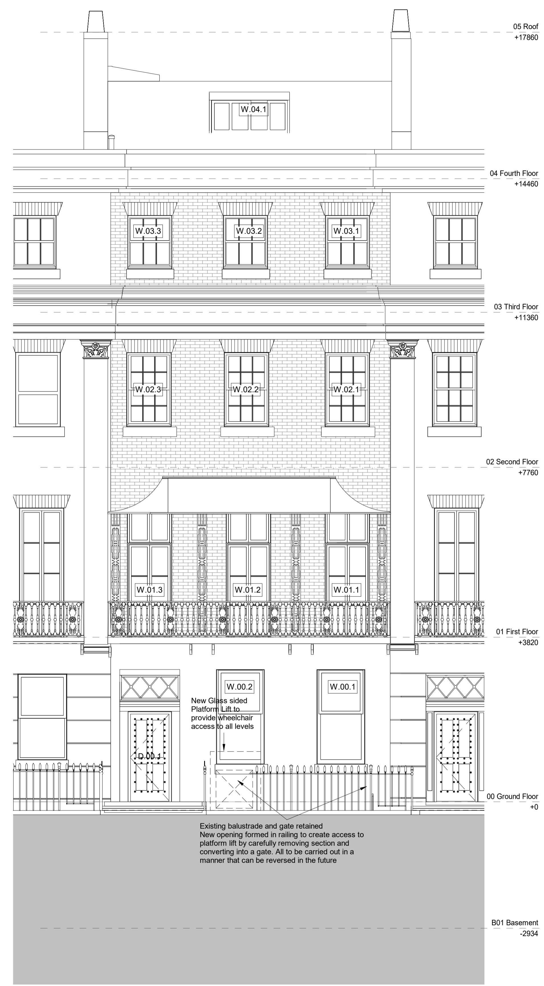
GA Proposed Rear Elevation