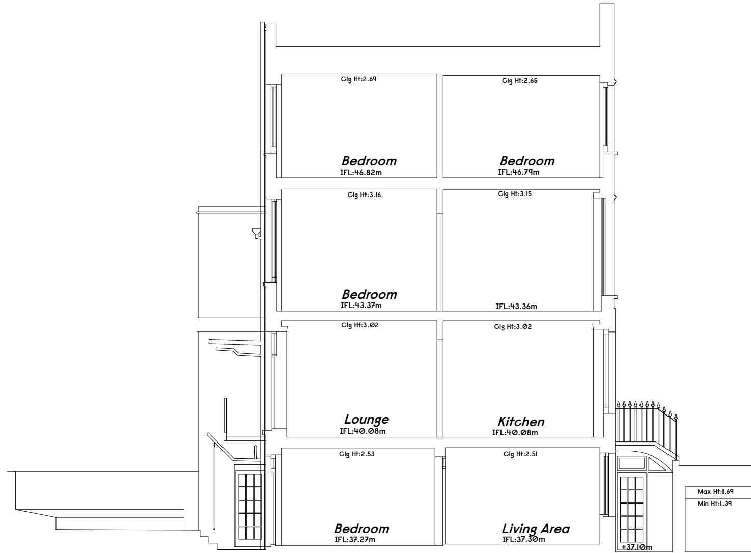
1 Existing Section 1:100 @ A3