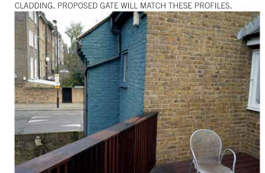
VIEW 5 - VIEW OVER EXISTING BALUSTRADE (TO REMAIN AS EXISTING) AND ADJACENT BRICK WALL TO HAVE HANDRAIL CLADDING APPLIED TO SAME HEIGHT AND APPEARANCE AS EXISTING HANDRAIL.