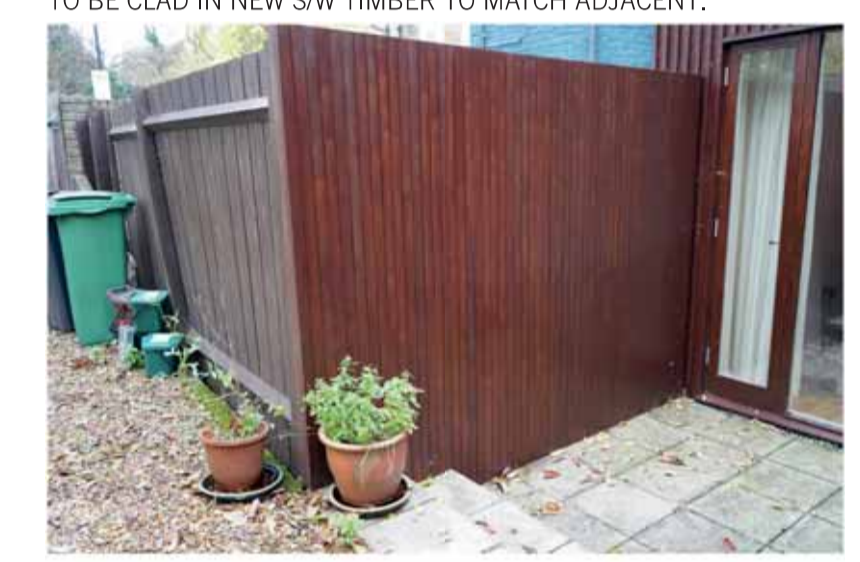
VIEW 3 - EXISTING FENCE WITH SW CLADDING. ADJACENT FENCE TO THE LEFT IS TO BE CLAD IN TIMBER TO MATCH.