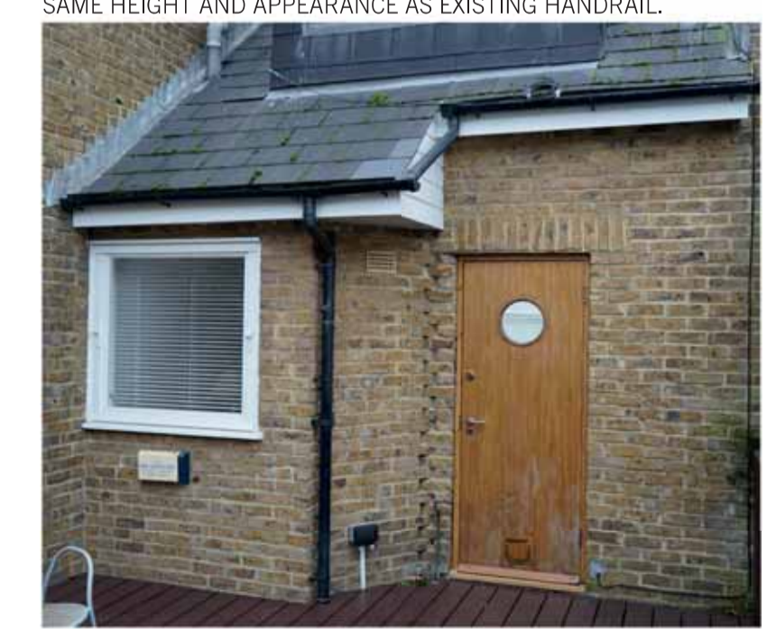
VIEW 6 - EXISTING FIRST FLOOR ENTRANCE OF MEWS TO AND ADJACENT NEIGHBOURING WALL. MEWS ENTRANCE TO BE TREATED WITH NEW SW TIMBER CLADDING TO MATCH APPEARANCE OF HIT & MISS CLADDING ON GROUND FLOOR.