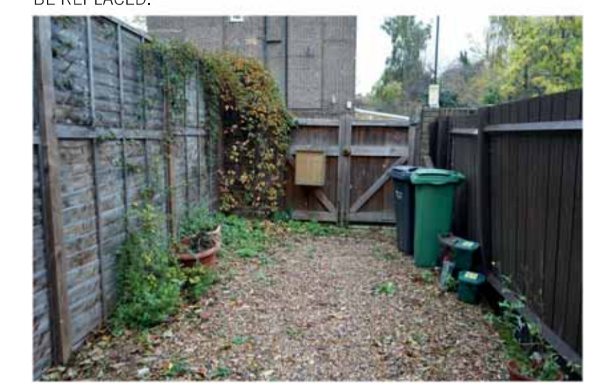
VIEW 2 - EXISTING GATE TO BE REPLACED AND FENCE PANELS TO BE CLAD IN NEW SW TIMBER TO MATCH ADJACENT.