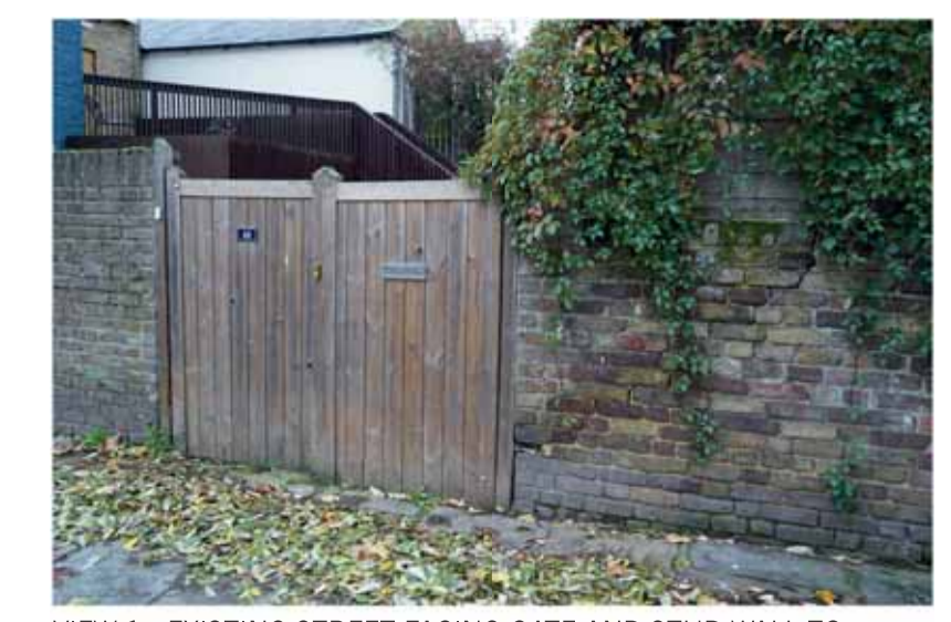
VIEW 1 - EXISTING STREET FACING GATE AND STUB WALL TO BE REPLACED.