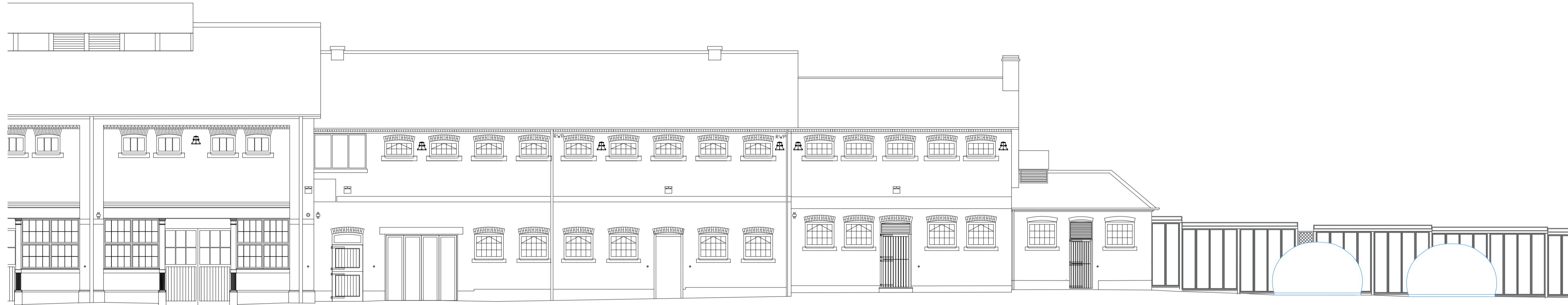
01 HORSE HOSPITAL SOUTH ELEVATION SCALE 1:100 © A1