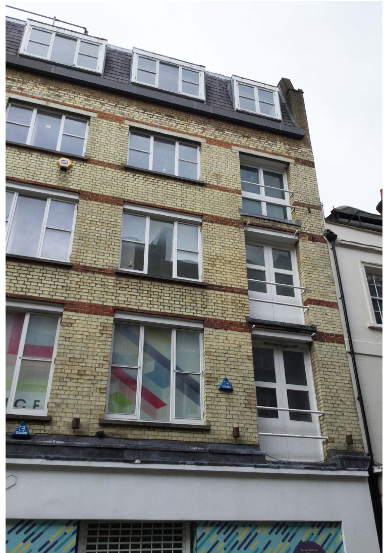
PH03 Front Elevation