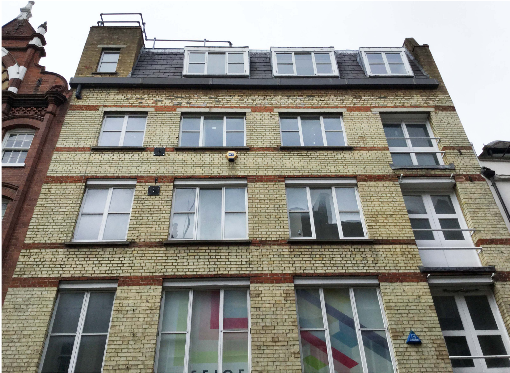
PH01 Front Elevation