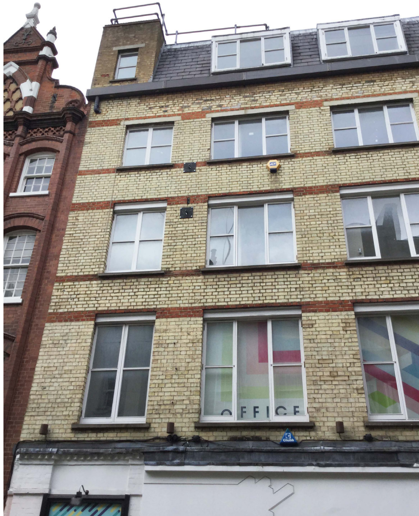
PH02 Front Elevation