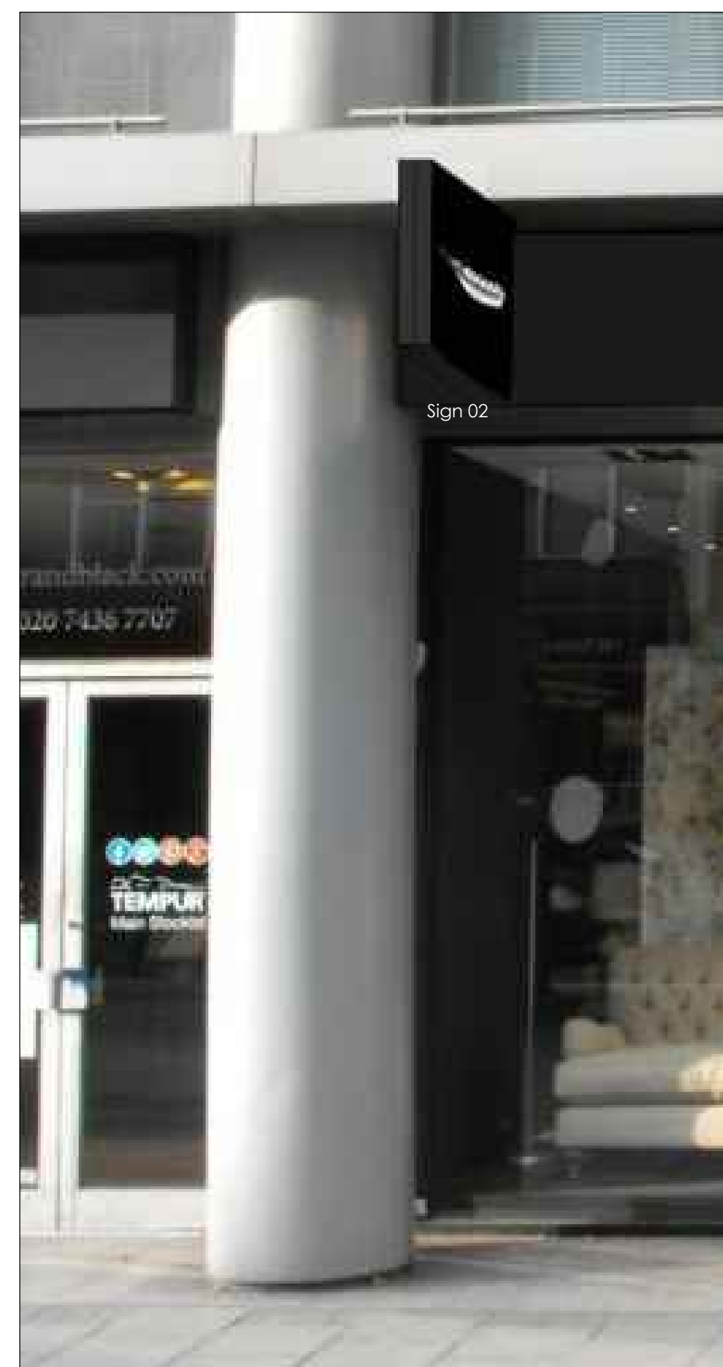
04 Proposed Signs 02