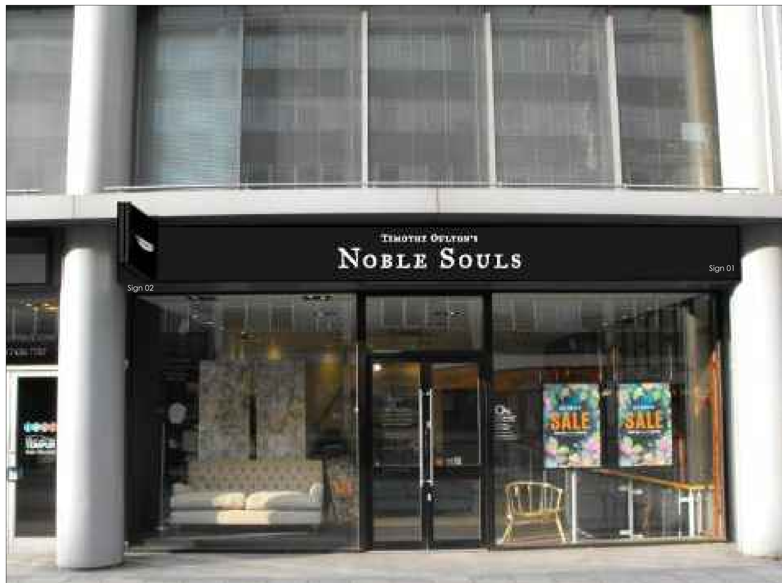
04 Proposed Signs 01 & 02