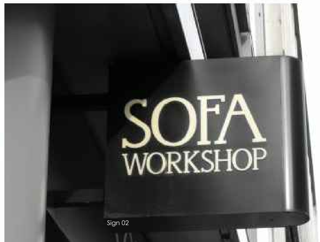
03 Existing Signs 01 02