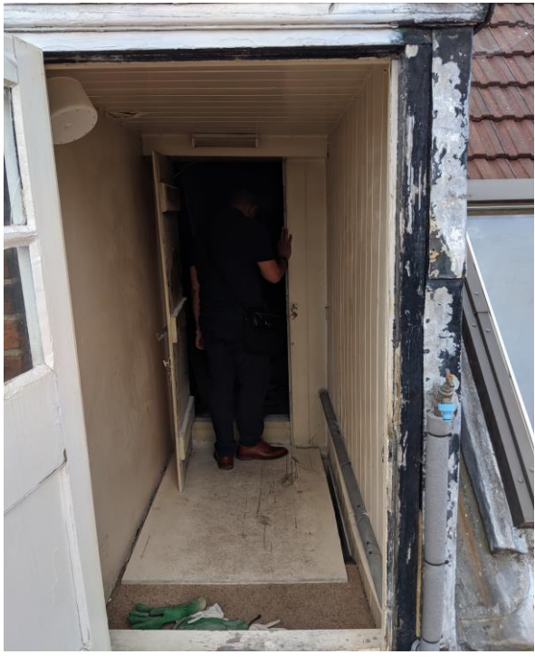
fig. 2: existing restricted doors and access to roof terrace and loft store.

The existing parade of shops comprises of ground floor commercial units with residential above displaying a mock-Tudor applied timber style. The parade was designed as a uniformed terrace and features front gable rhythm interrupted by dormers finished in lead and timber. Properties at nos. 15C and 19C featured enlarged rear dormers without obstructing the established rear/north facing roof terraces as seen in the image below: