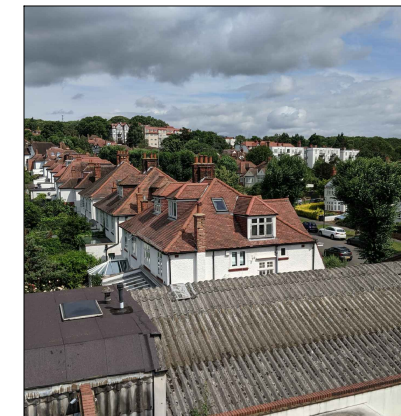
View from North Facing roof terrace