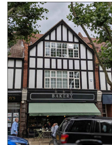
Streetscene Perspective of 21 Swain's Lane