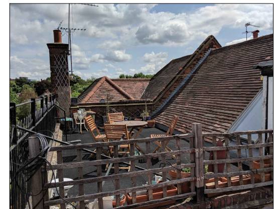
Roof terrace to residential unit at no. 23 Swain's Lane