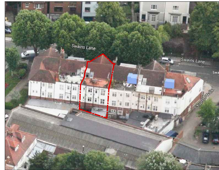
Aerial view of North Elevation