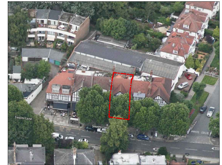
Aerial view of South Elevation