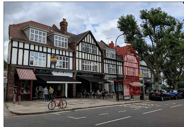
Streetscene Perspective of 21 Swain's Lane