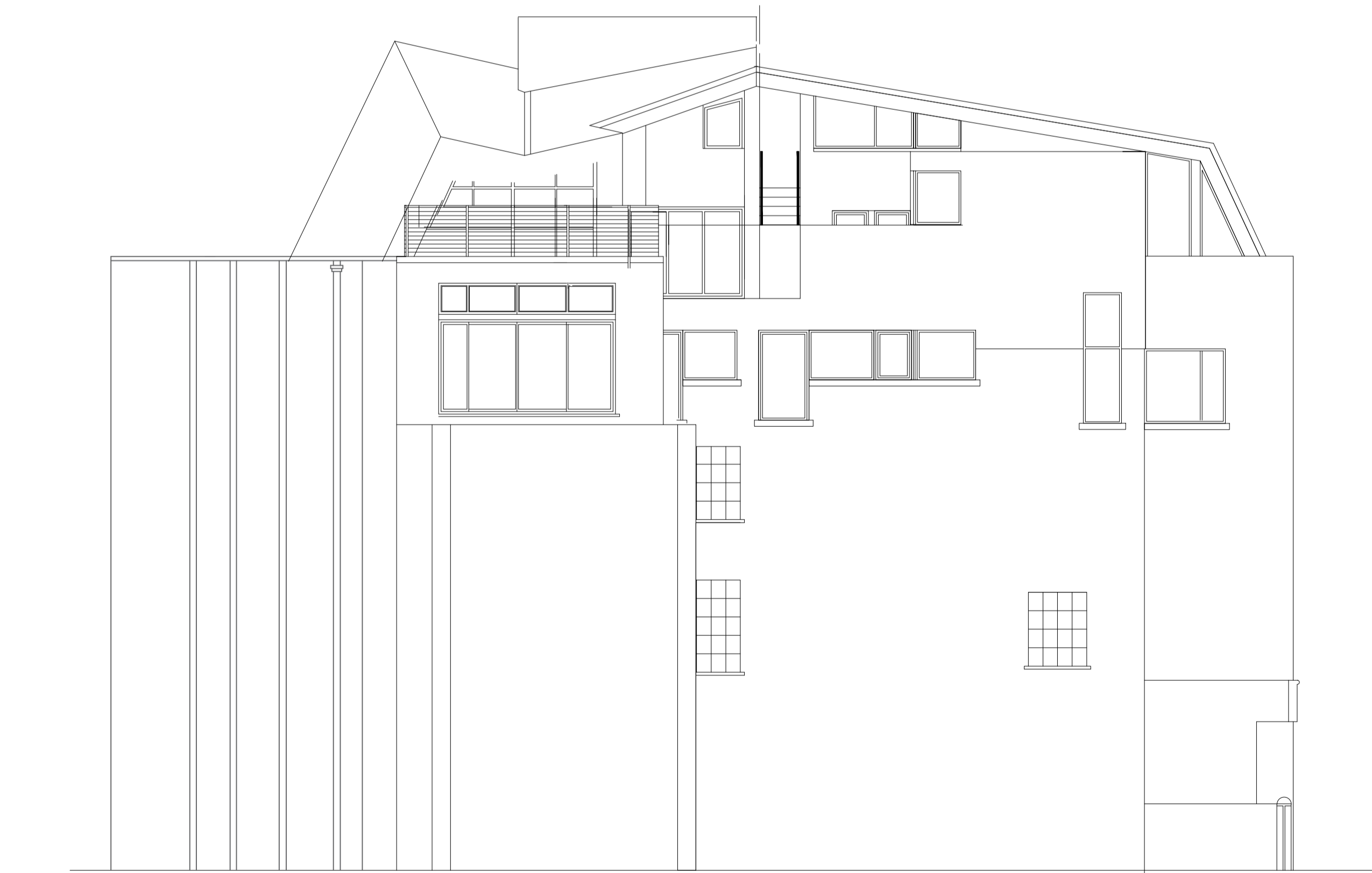
4 Proposed Side Elevation 1:100