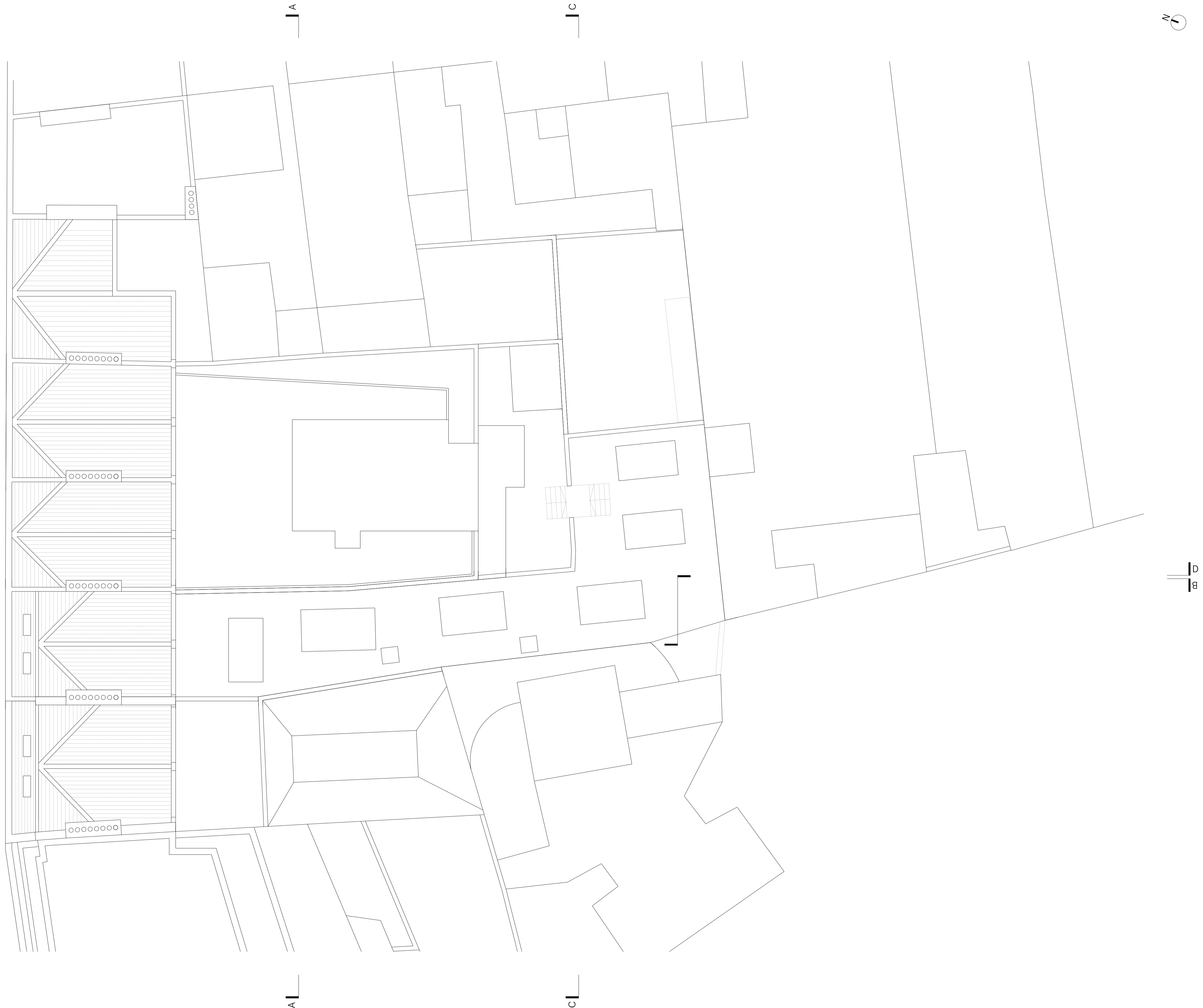
1 PROPOSED ROOF PLAN