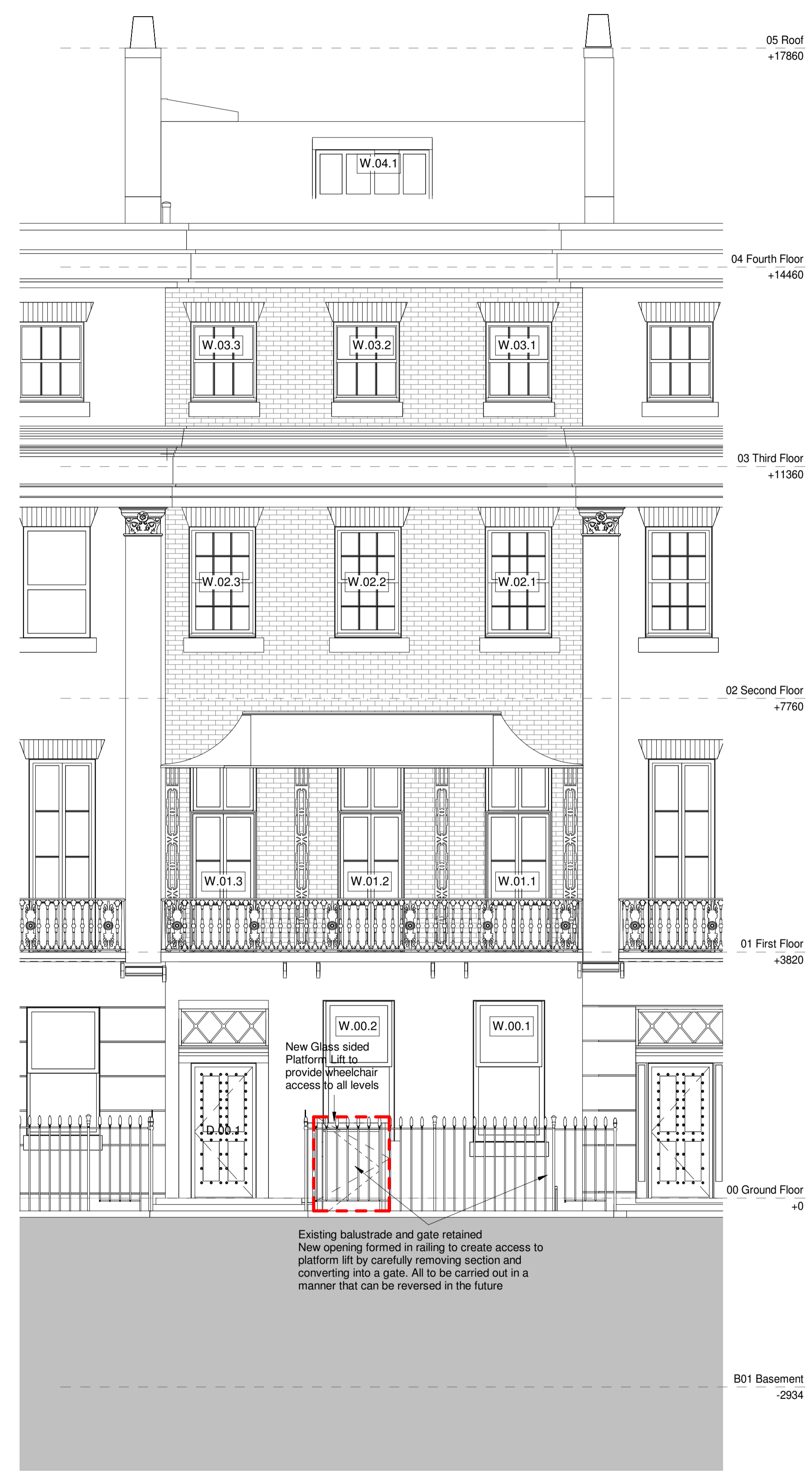
GA Proposed Rear Elevation

Note: All external vents within rendered wall (Basement and Ground Floor level) to be white All external vents within brick wall (First to Fourth Floor level) to be black