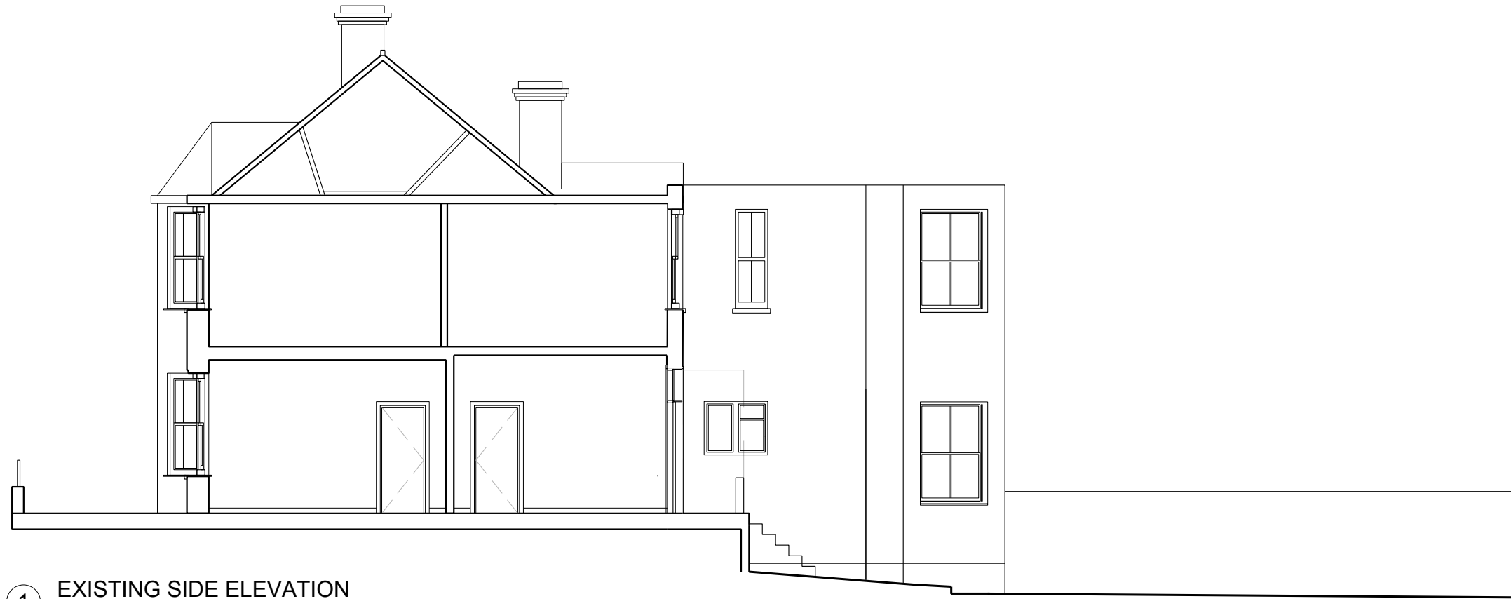
1 EXISTING SIDE ELEVATION Scale: 1:100