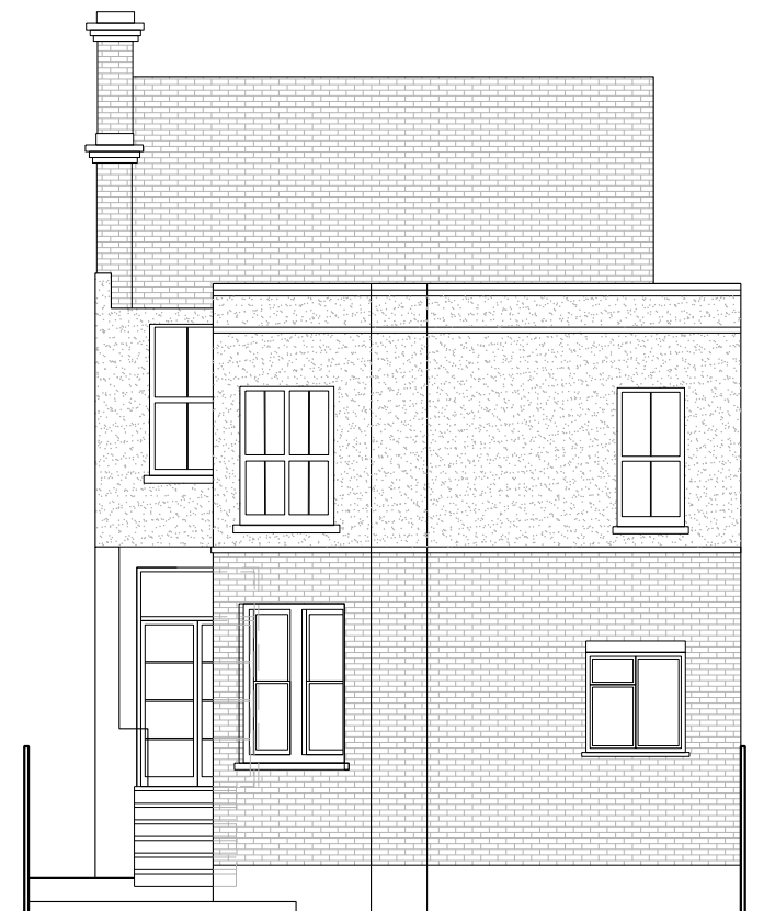
3 REAR ELEVATION Scale: 1:100

Note: This drawing is intended to illustrate the design intent only. All elements are shown indicatively and it is not the intention to detail building construction. This responsibility is on the main contractor and sub-contractors involved