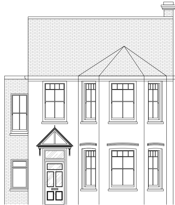
2 FRONT ELEVATION Scale: 1:100