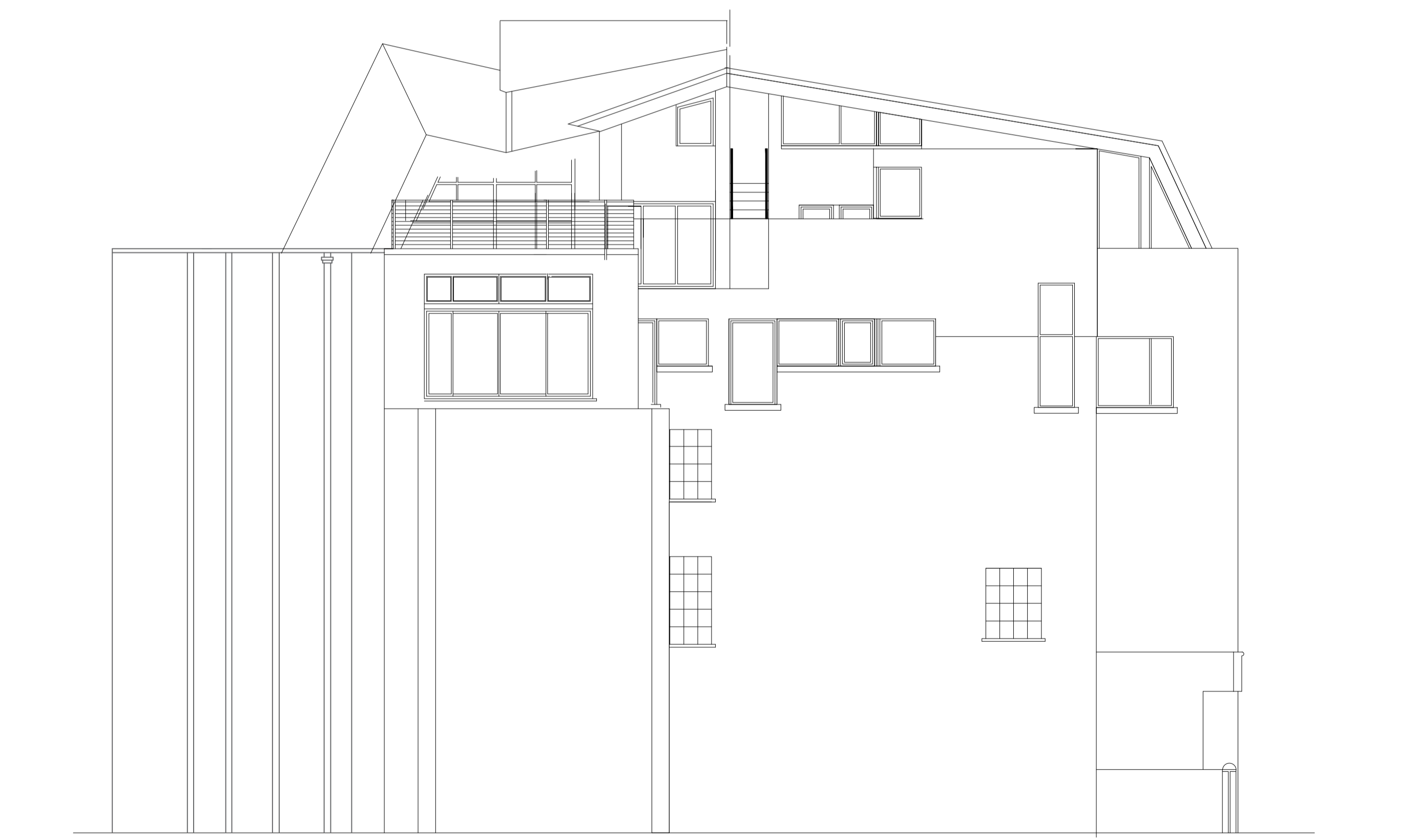
4 Existing Side Elevation 1:100