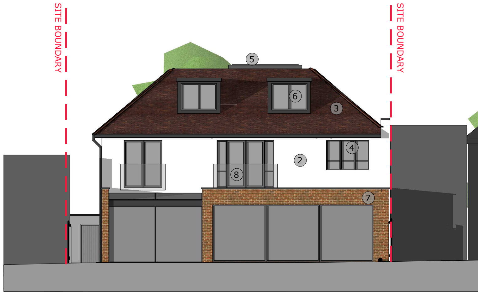
[01] PROPOSED REAR ELEVATION (north east)