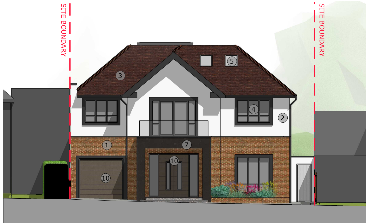
[01] PROPOSED FRONT ELEVATION (south west)