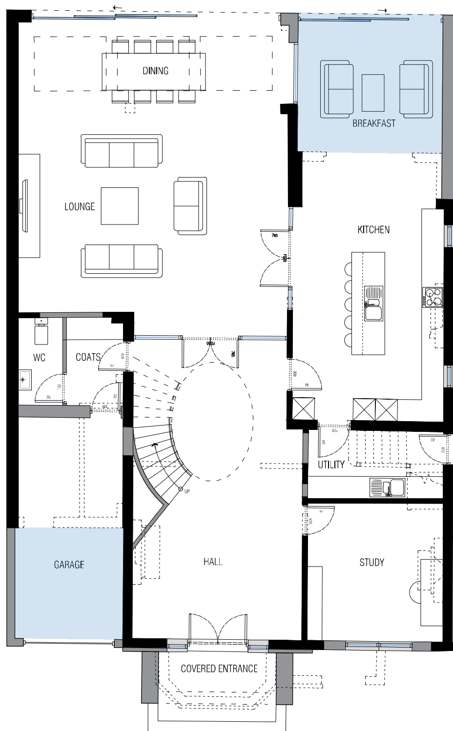
[01] GROUND FLOOR PLAN