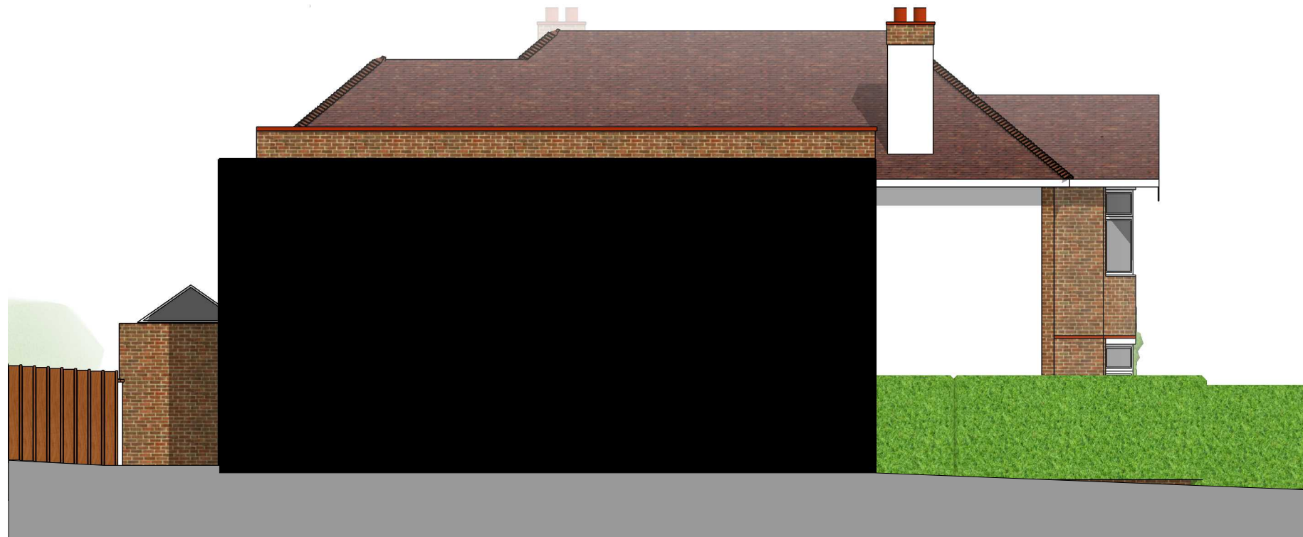
[02] PROPOSED SIDE ELEVATION 2 (north west)