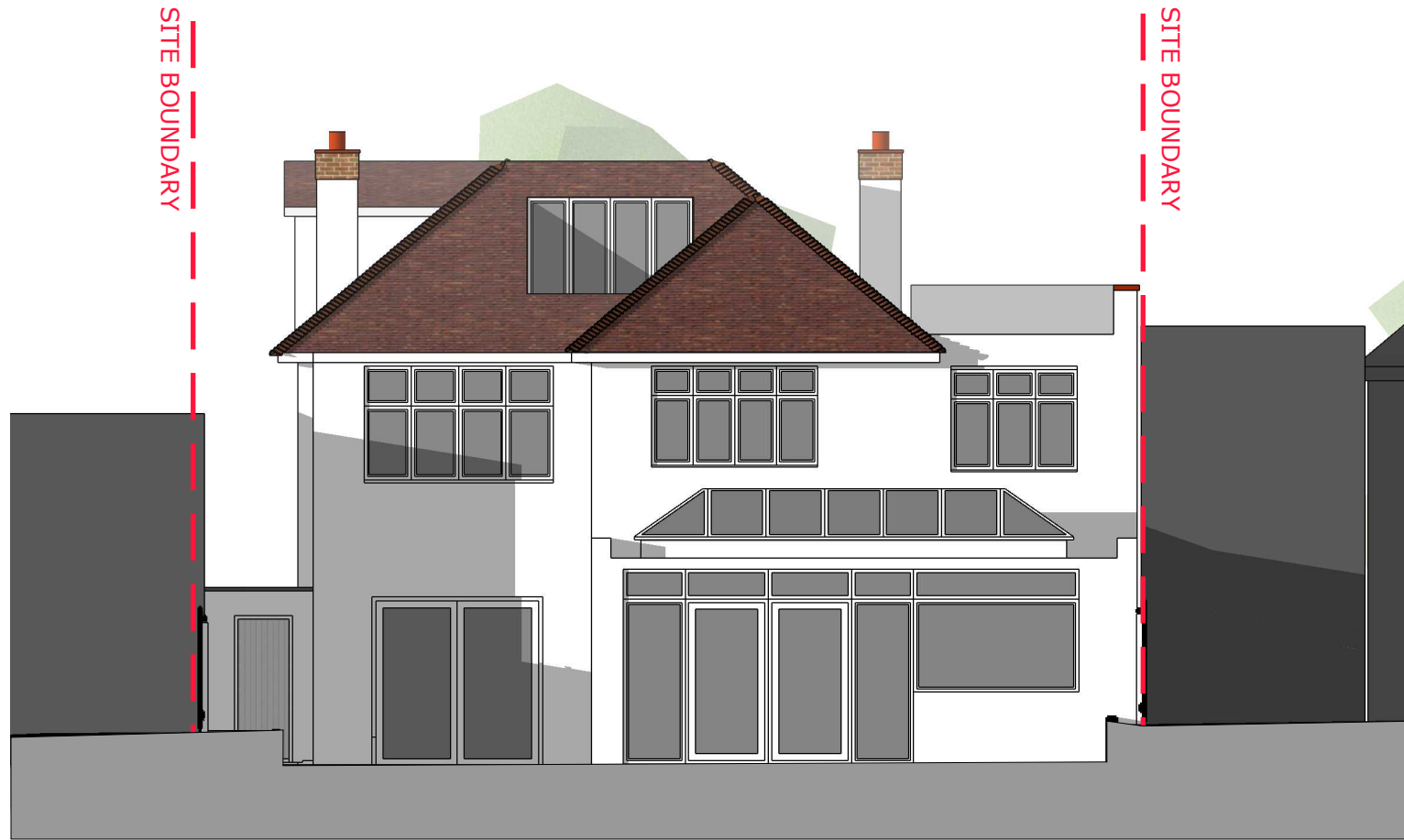
[01] PROPOSED REAR ELEVATION (north east)