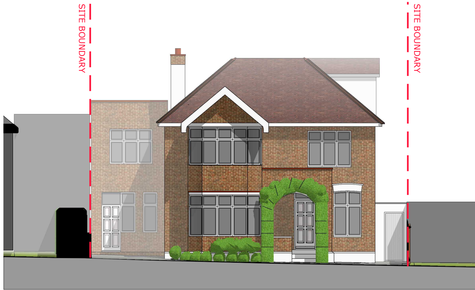
[01] PROPOSED FRONT ELEVATION (south west)