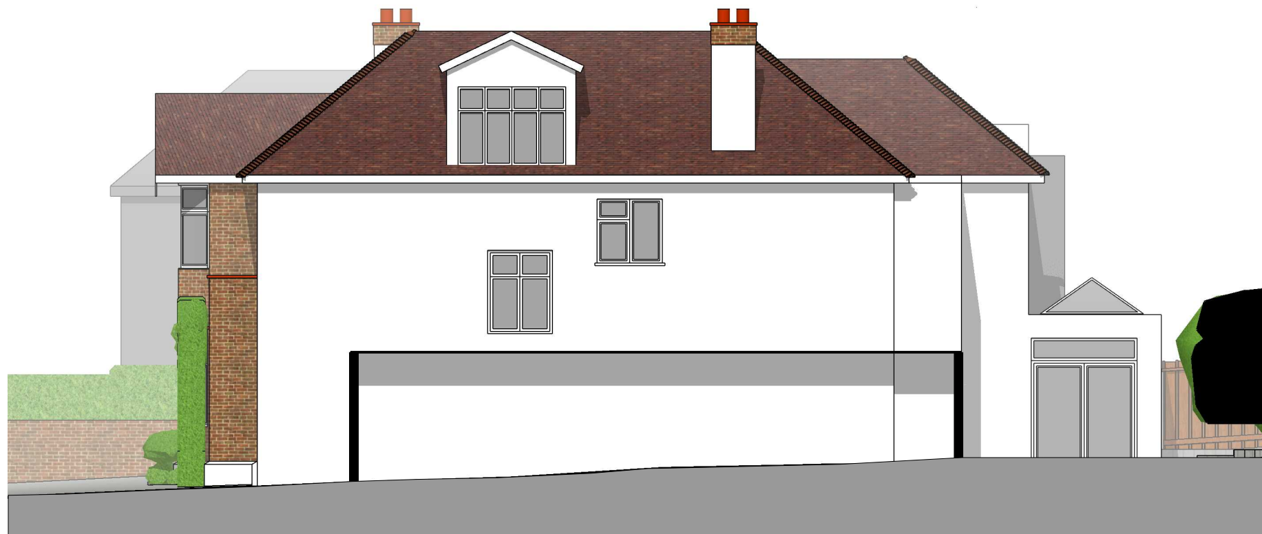
[02] PROPOSED SIDE ELEVATION 1 (south east)