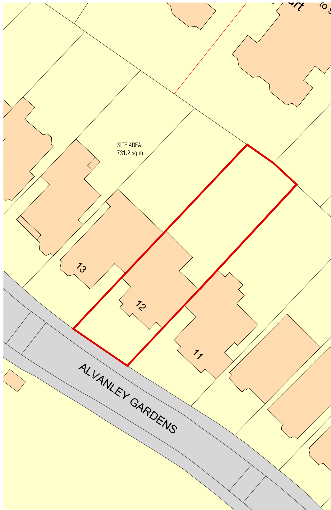
[02] BLOCK PLAN 1:500