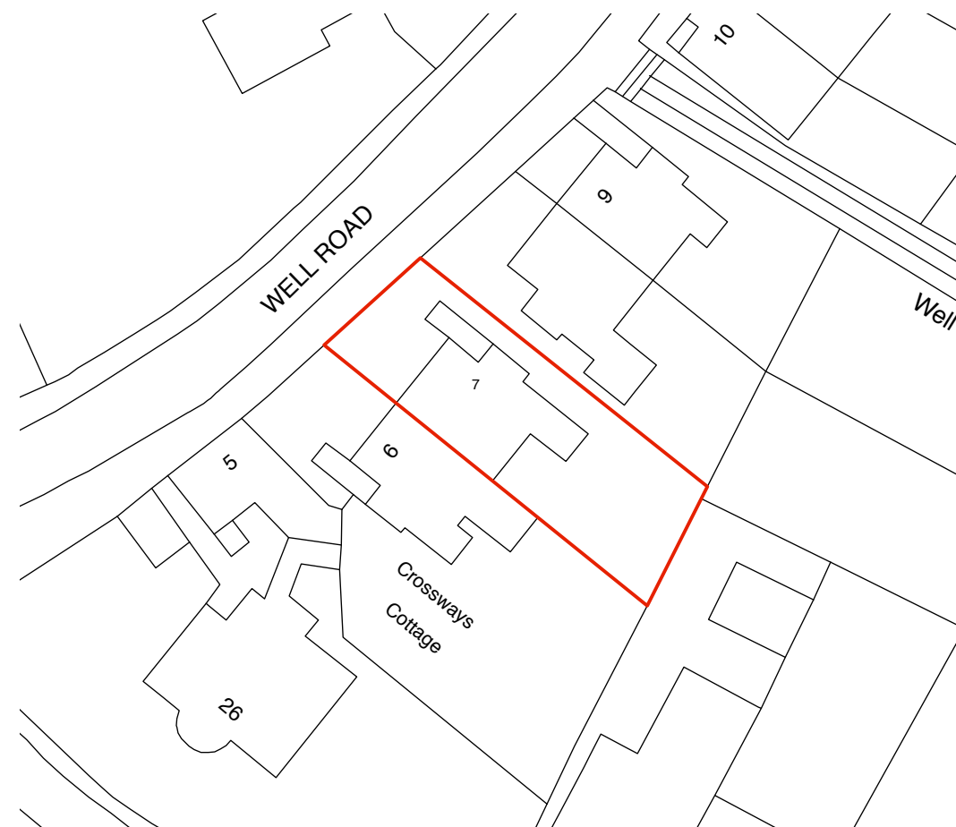
Site Plan Scale @ 1:500