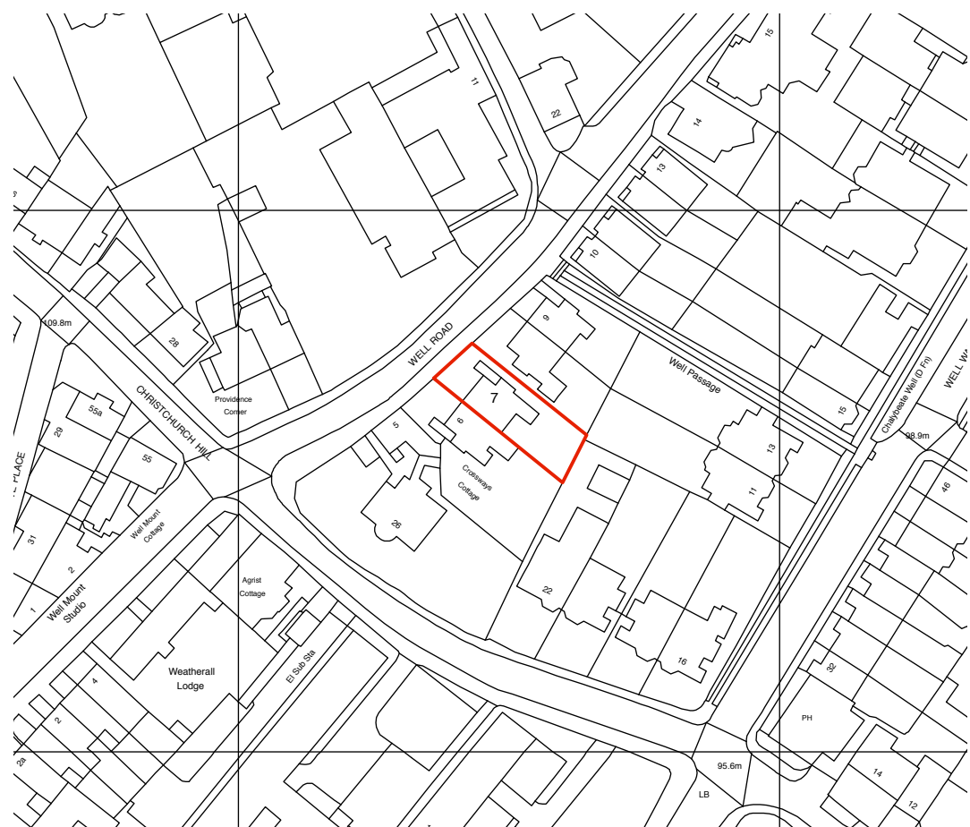
Location Plan Scale @ 1:1250

This drawing has been produced to diagrammatically show the spaces of the property - all measurements are approximate and need to be verified on site