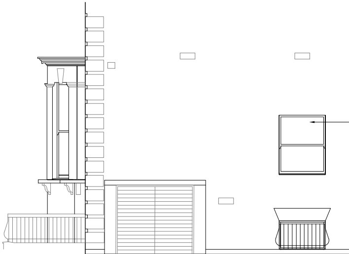
PROPOSED SOUTH FACING ELEVATION

New timber double glazed sash window to replace existing metal/ aluminum windows to compliment conservation area, and adjacent properties