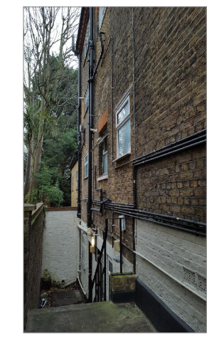
NORTH FACING ELEVATION