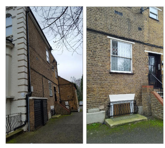
SOUTH FACING ELEVATION