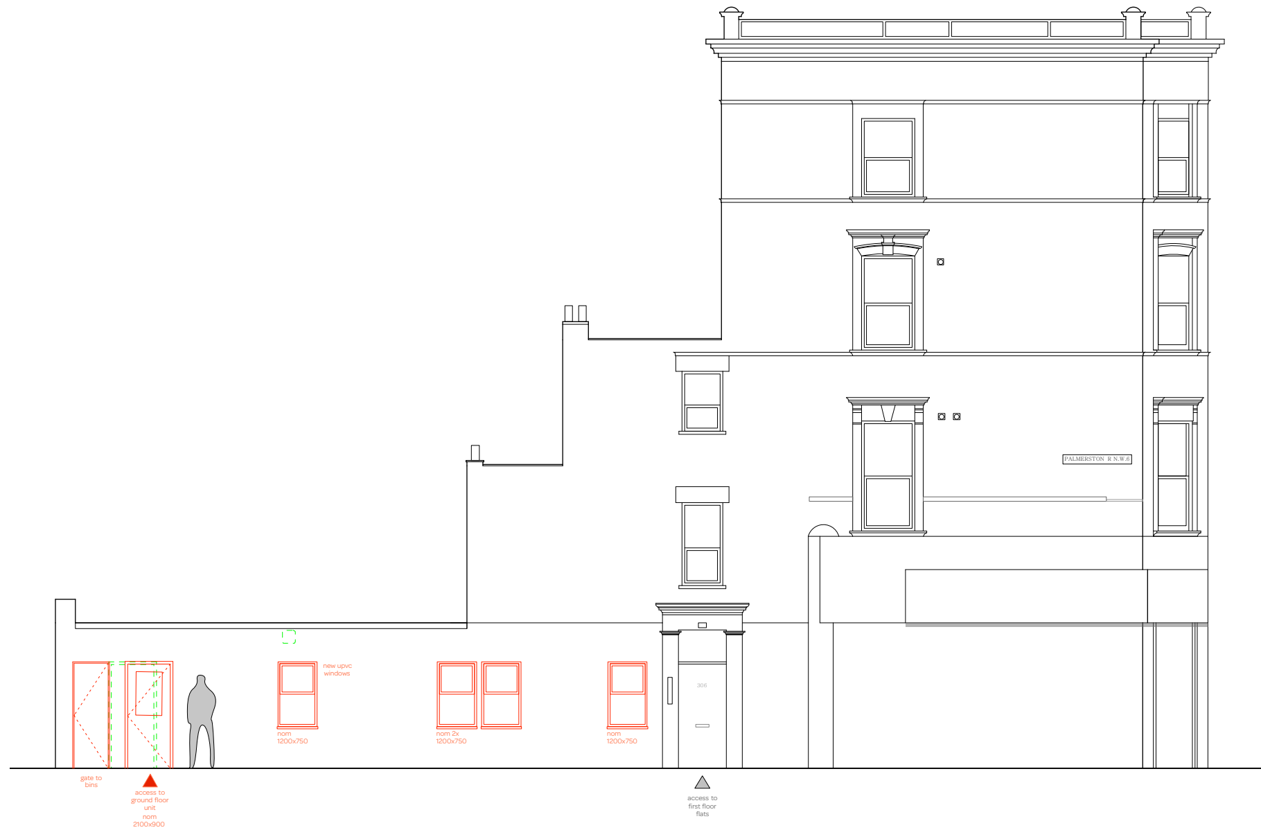
Proposed North West Elevation