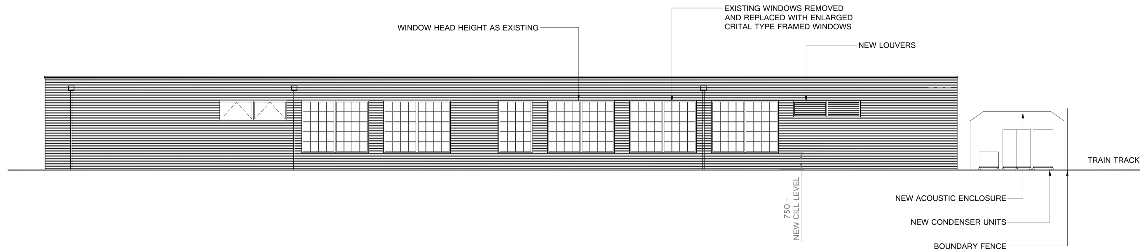
02 ELEVATION A - NORTH PROPOSED Scale: 1:100