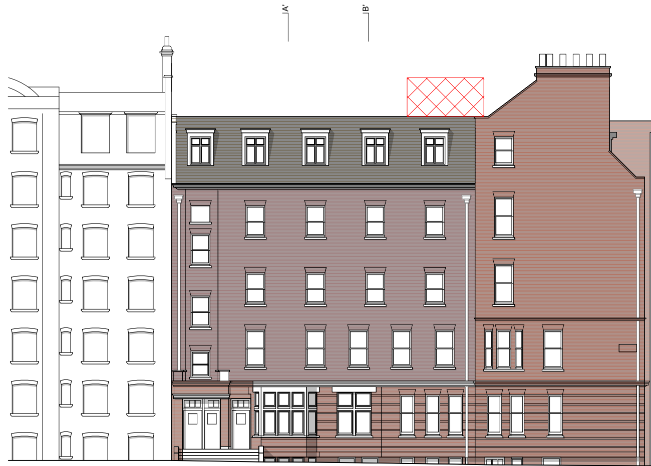
South Elevation - Existing