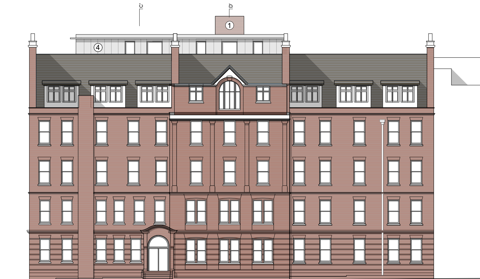
East Elevation - Proposed