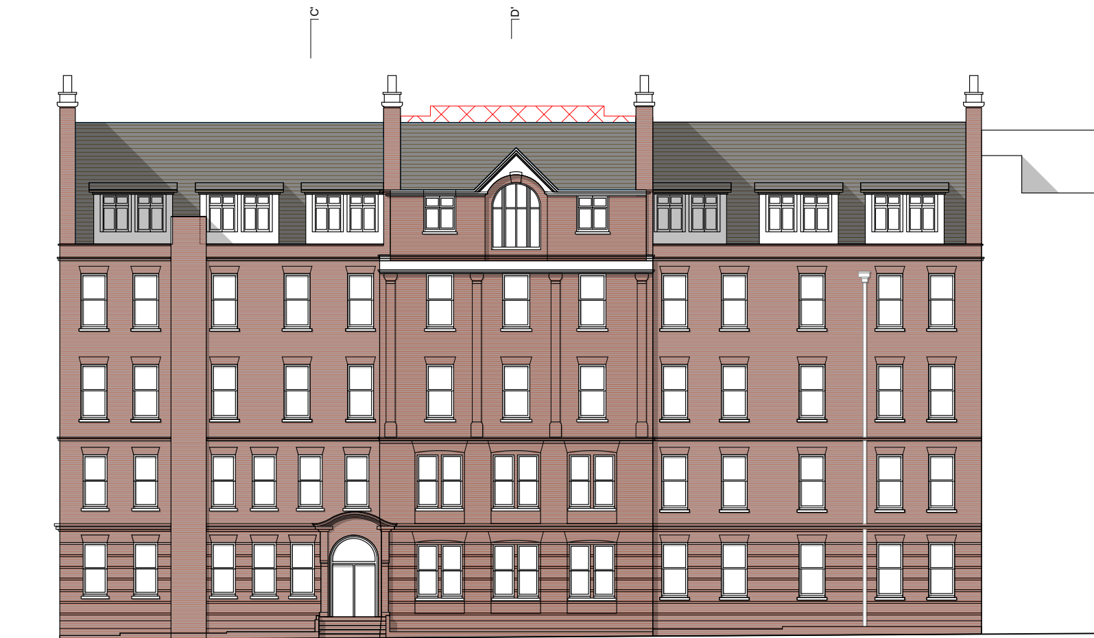
East Elevation - Existing