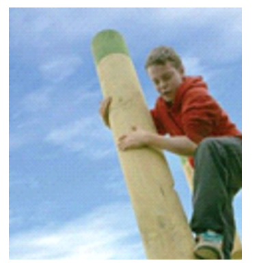
Wicksteed playscapes 'Stilts'