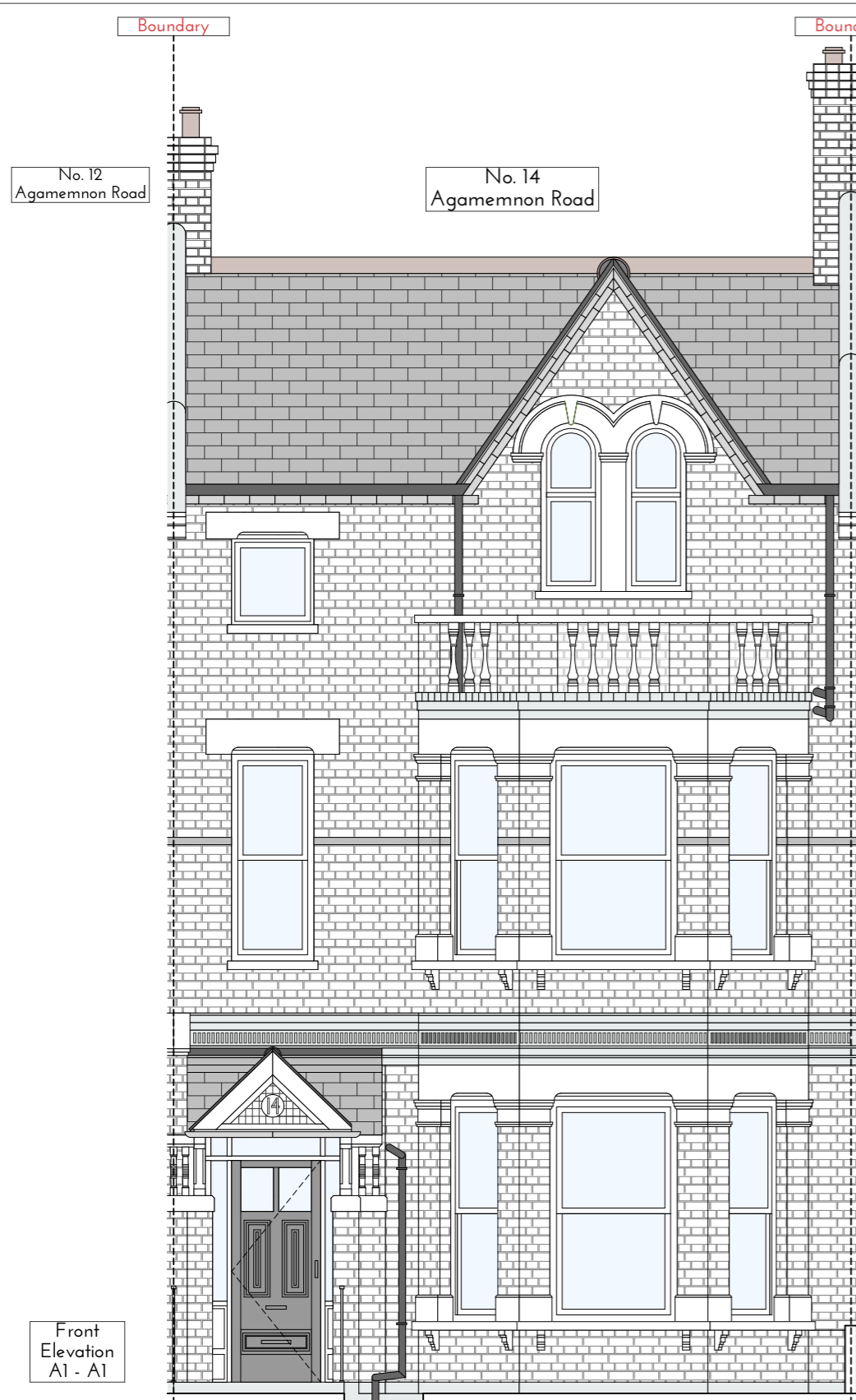
Front Elevation A1 - A1