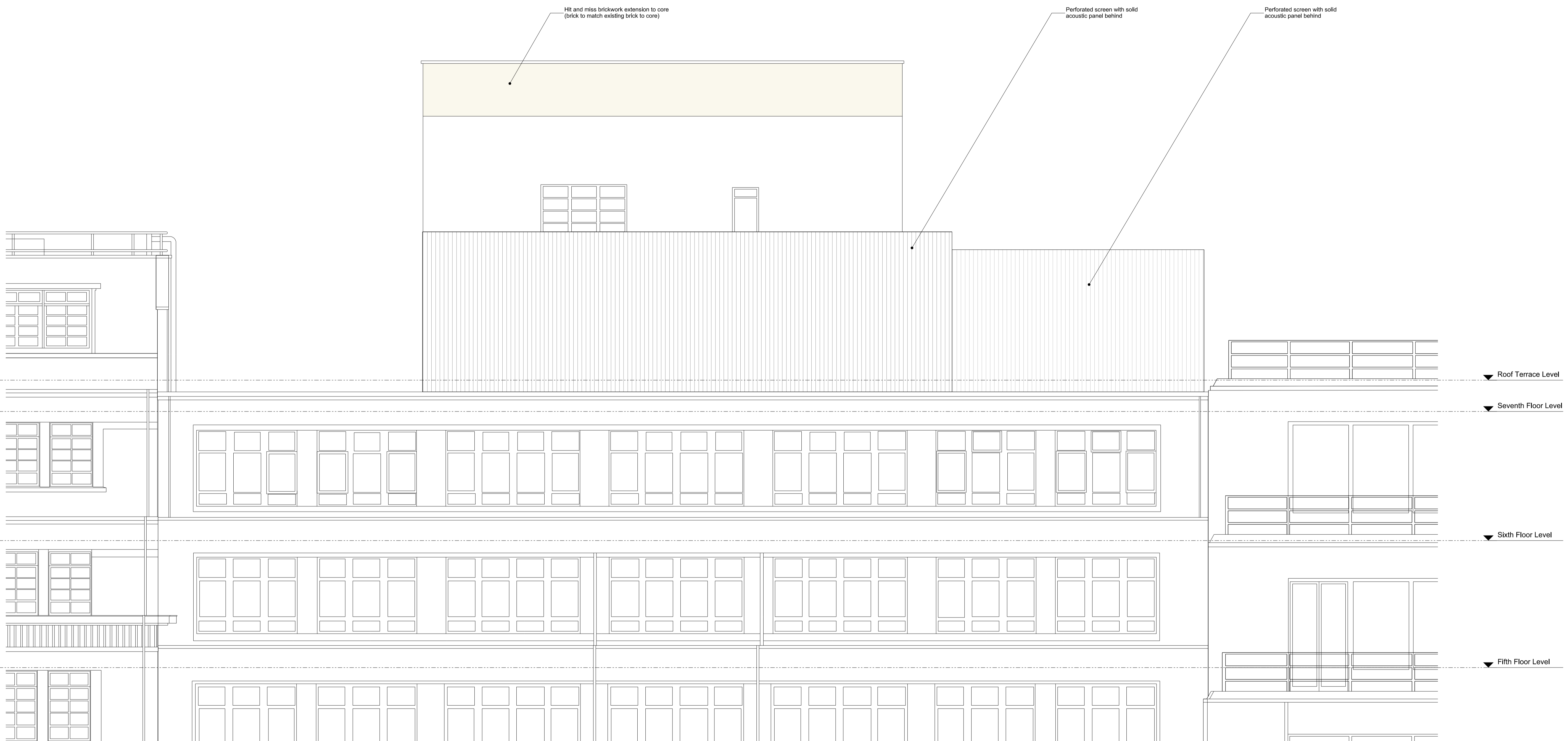
01 Proposed North Elevation 1:50

Copyright Cousins&Cousins Architects. No implied license exists. This drawing should not be used to calculate areas for the purposes of valuation. All dimensions be checked on site by the contractor and such dimensions to be their responsibility. Do not scale drawings. All work must comply with relevant British Standards and Building Regulations requirements. Drawing errors and omissions to be reported to the architect.